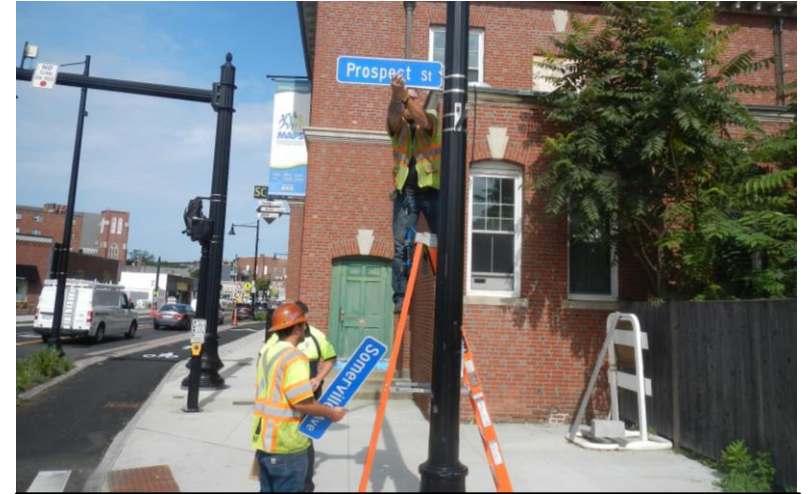
SAUSI Sign installations