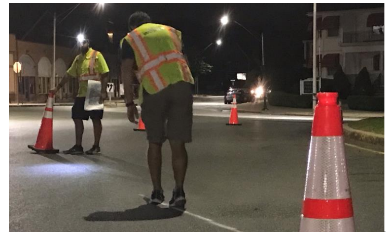
Powder House Circle layout