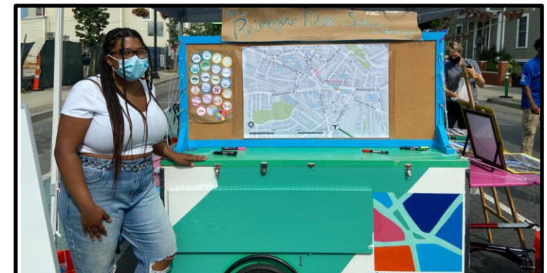
CDG at Farmers Market