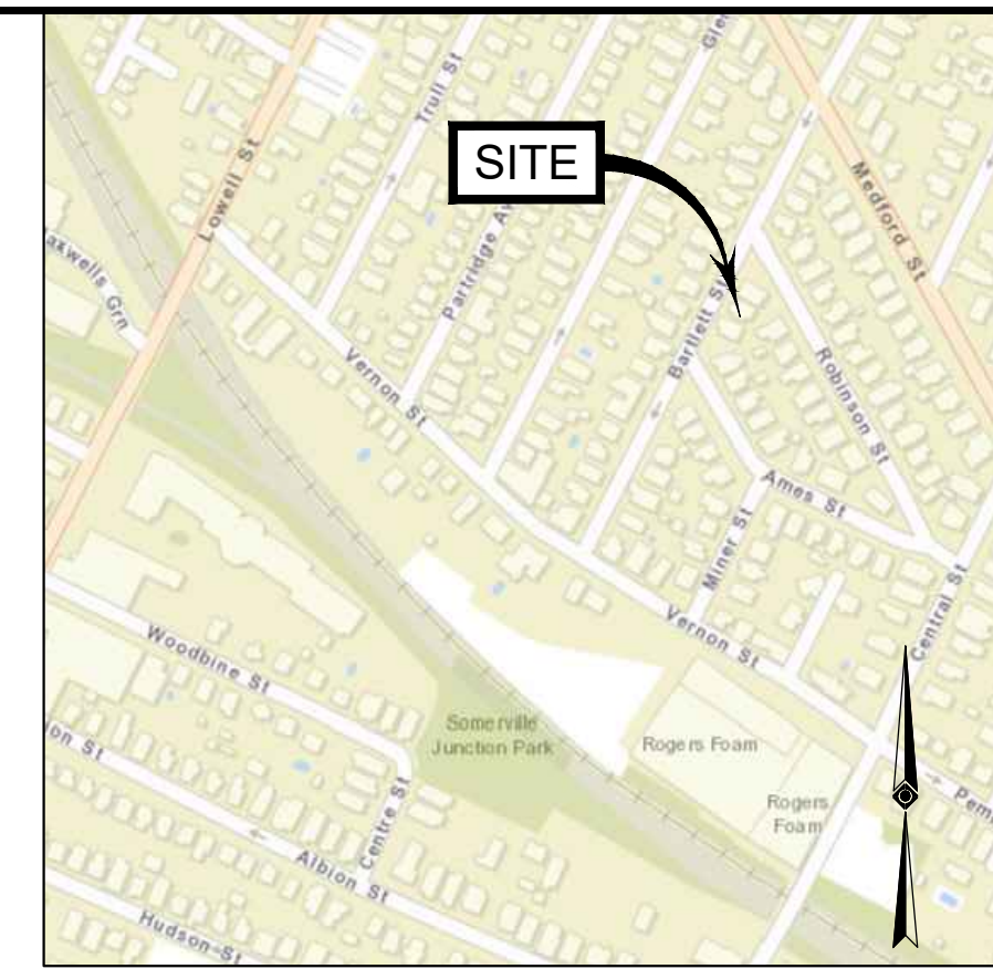
VICINITY MAP © 2022 ESRI WORLD LIGHT GRAY CANVAS (NOT TO SCALE)