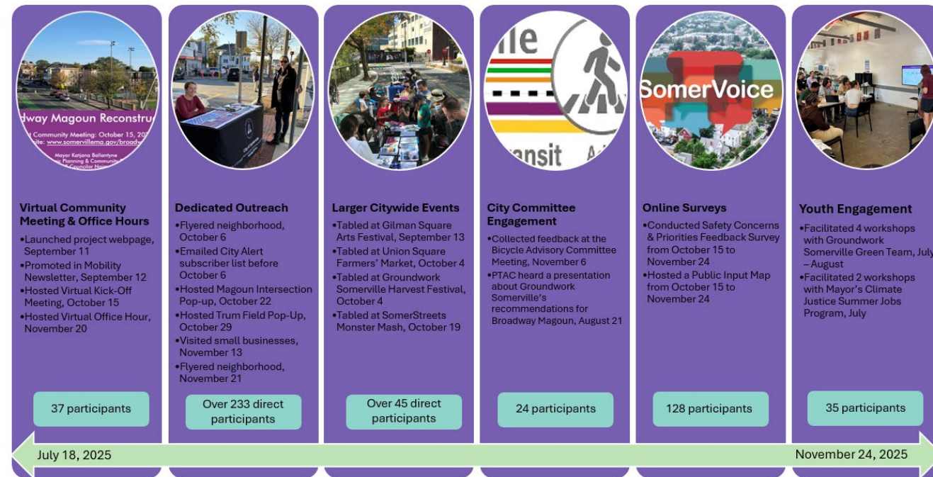
Broadway Magoun Reconstruction Project pre-concept design engagement timeline