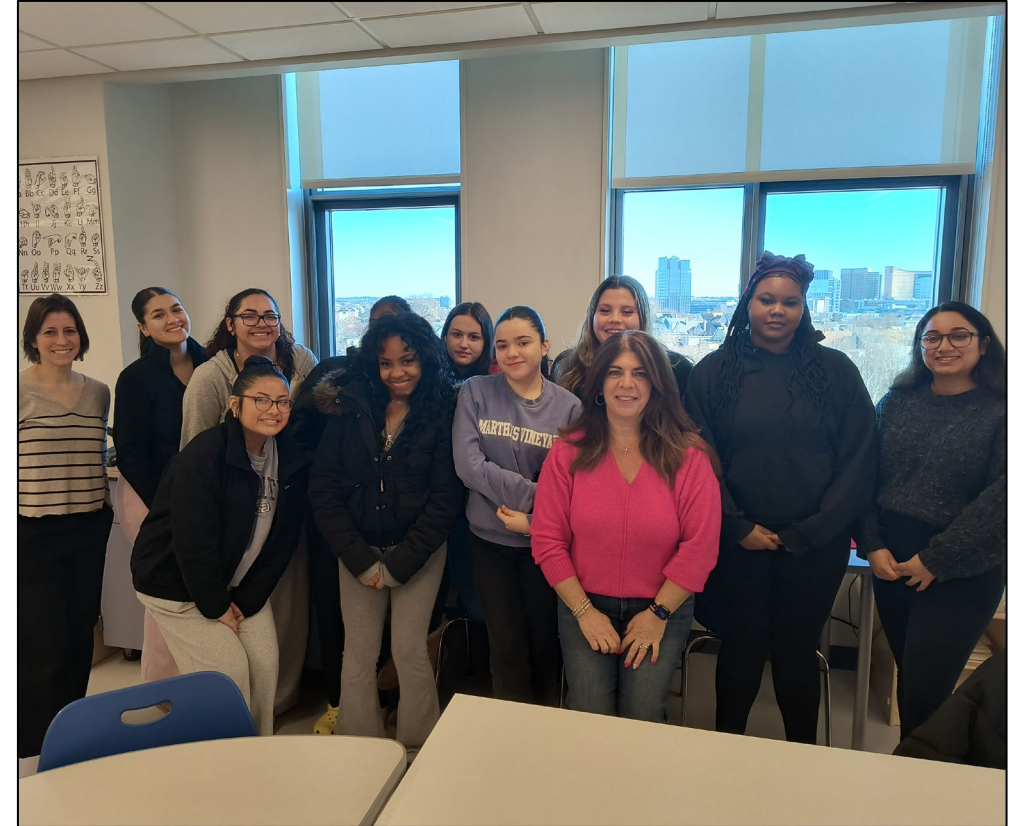
High School students from the Center for Career and Technical Education program who assisted with pedestrian safety trainings, March 2025