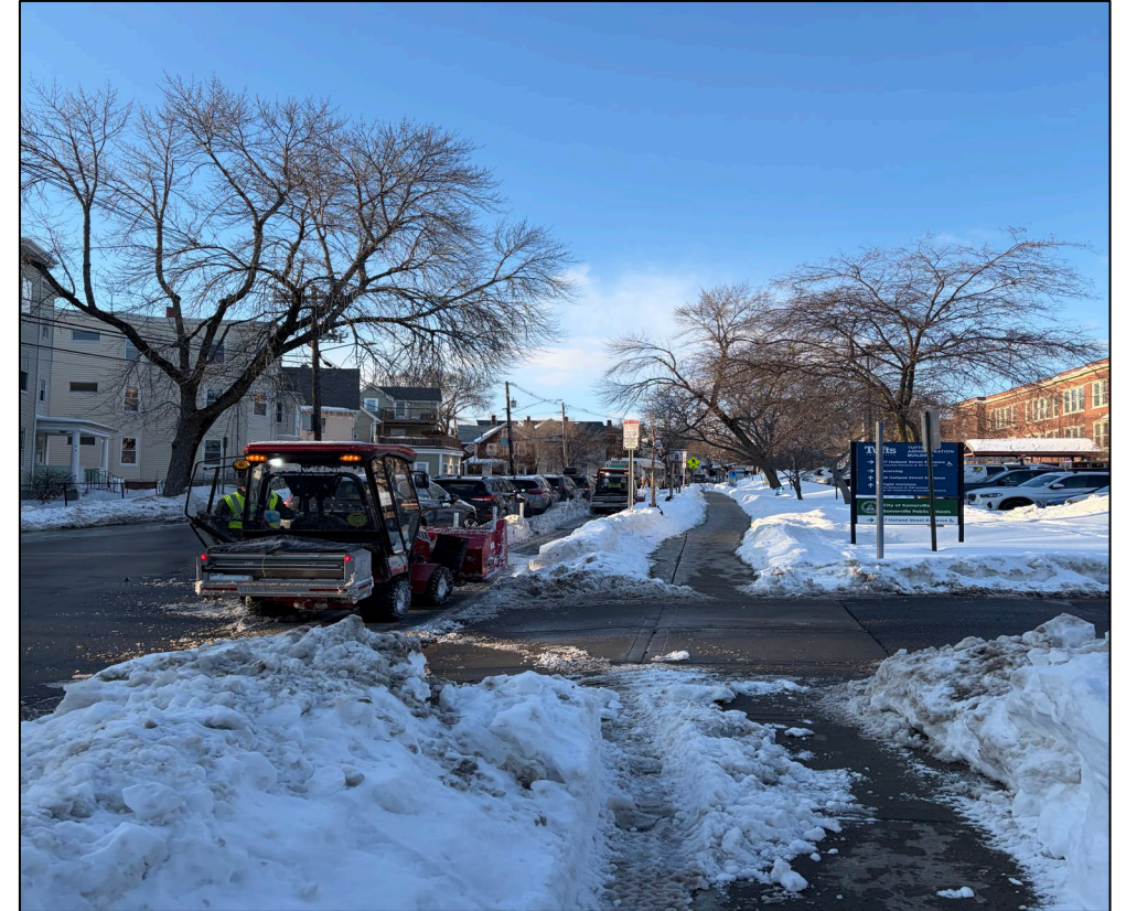
Snow plow clearing bike lanes on Holland Street, January 2026