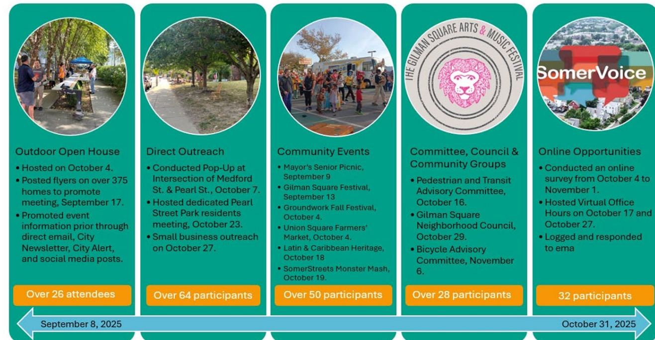
West Pearl Street Reconstruction Project updated design engagement timeline