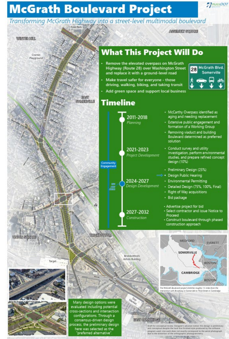
McGrath Boulevard Project open house poster, December 2025