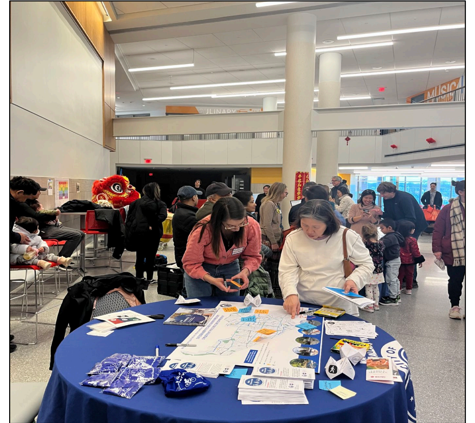
Lunar New Year Celebration, Somerville High School, January 2025