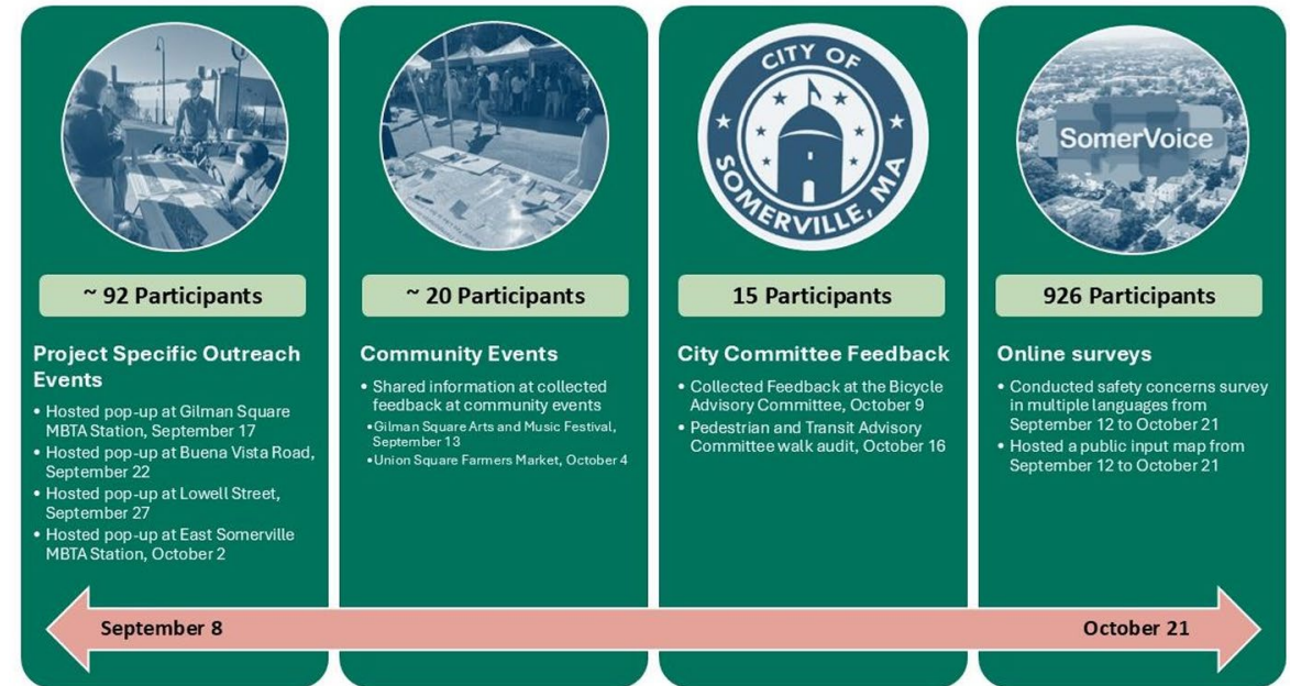
Community Path Safety Improvements engagement timeline