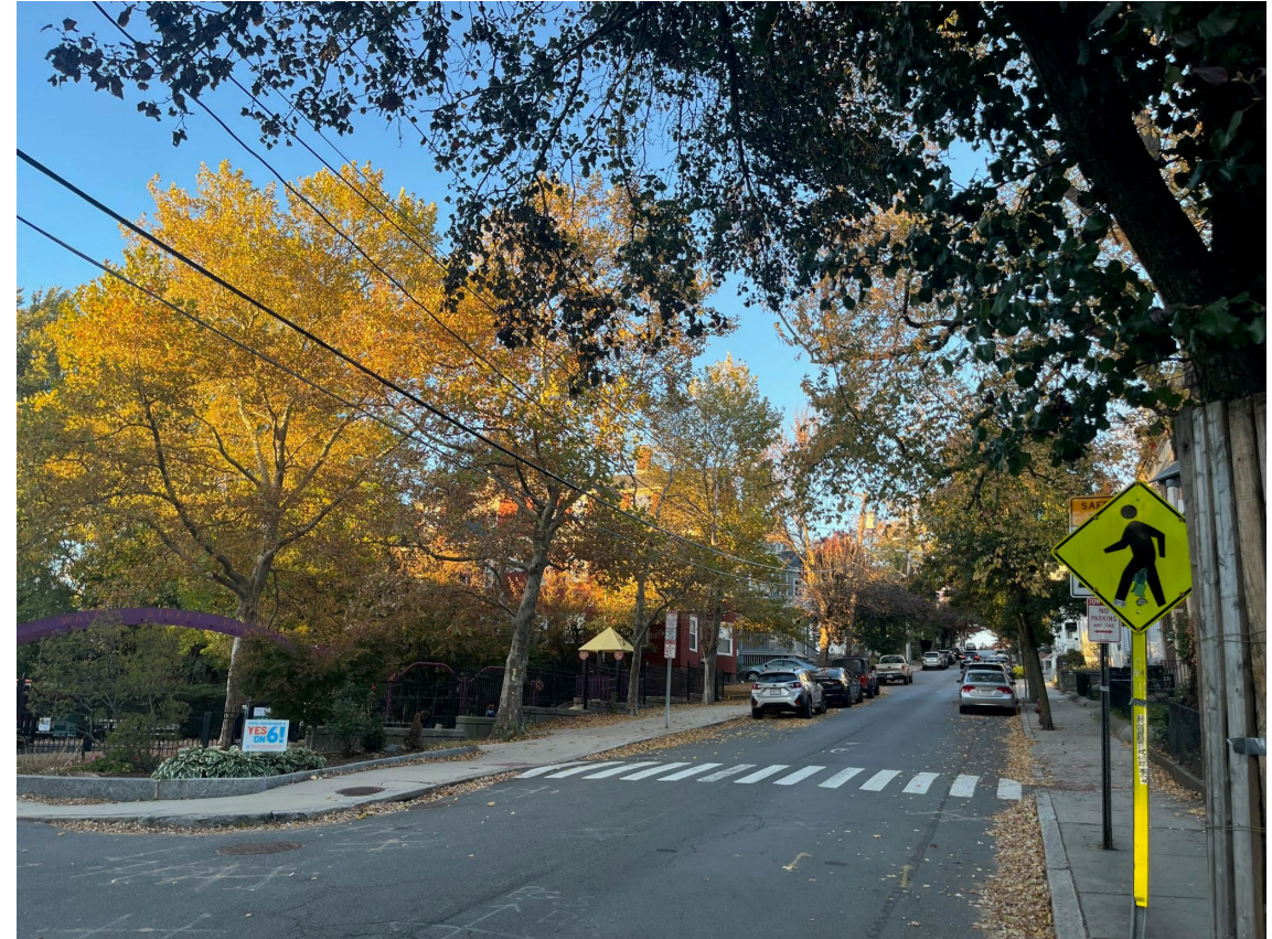
Above: Walnut Street