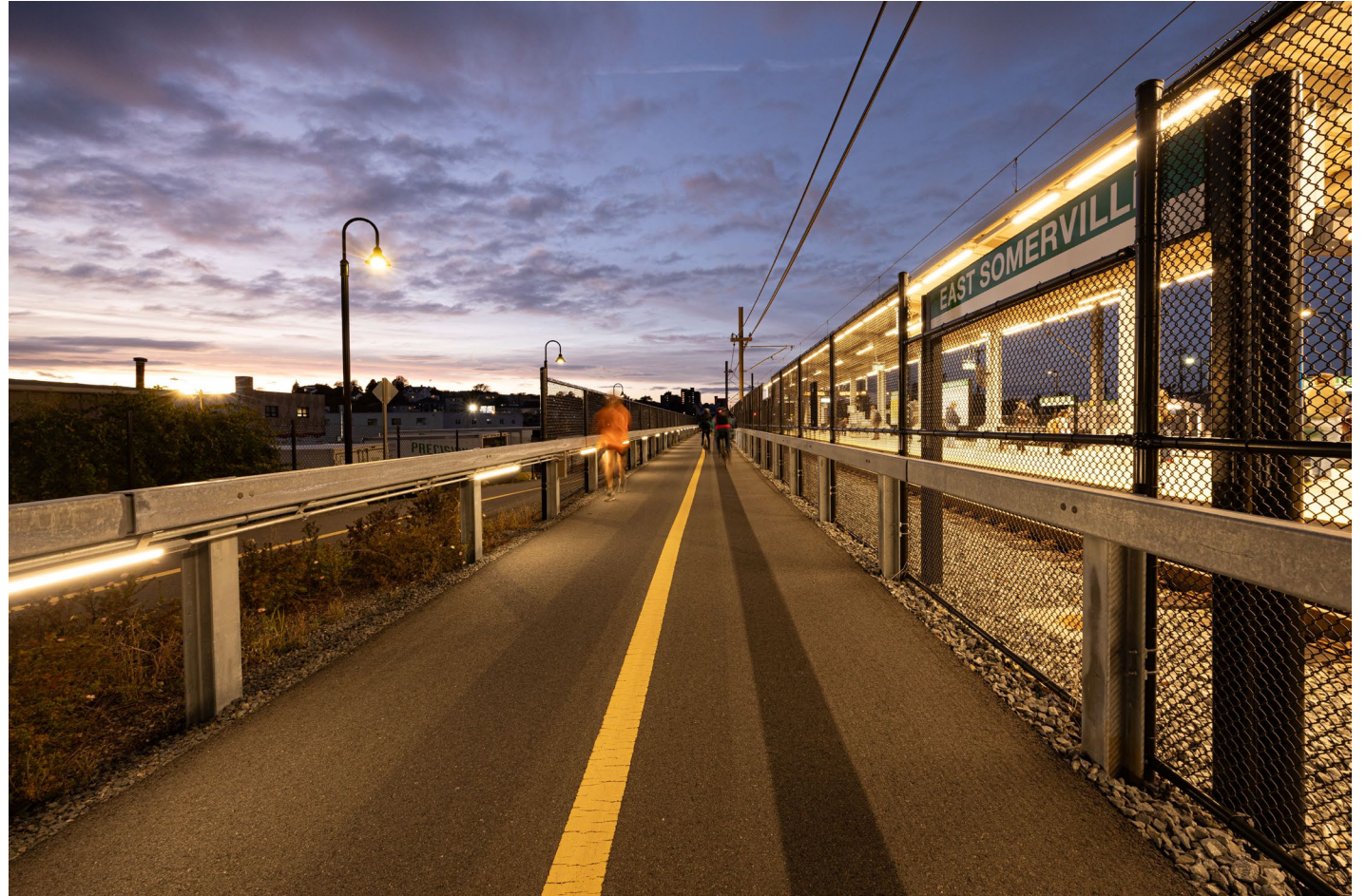
Above: New Community Path Lighting (Credit: Arup)