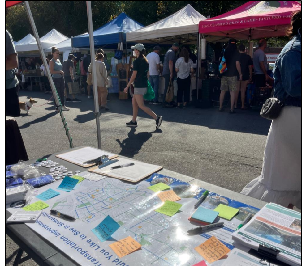
Somerville Bicycle Advisory Committee and OSPCD Mobility Division tabling at the Union Square Farmers Market, October 2025