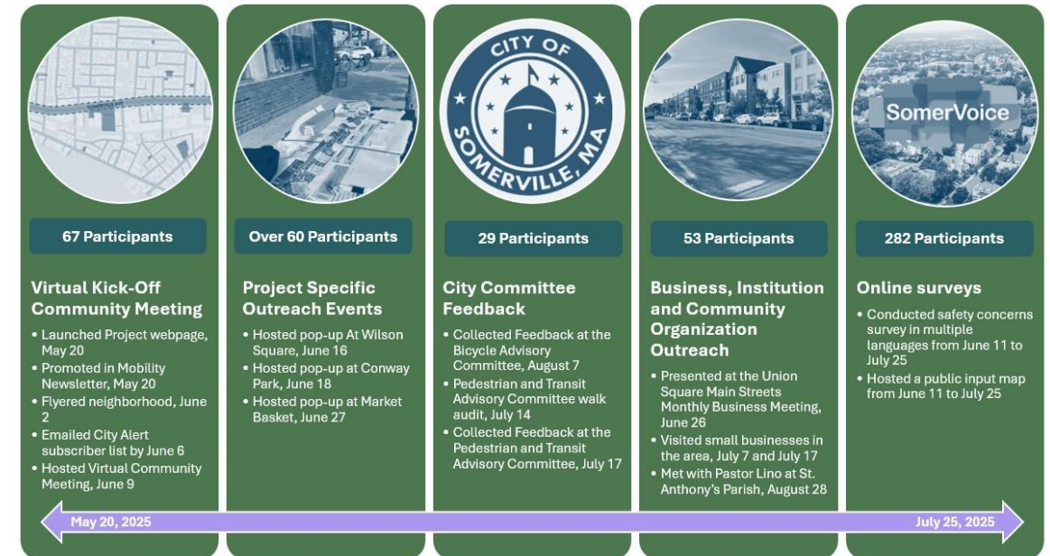
Somerville Avenue Quick-Build Safety Improvements Phase 1 Community Engagement Timeline