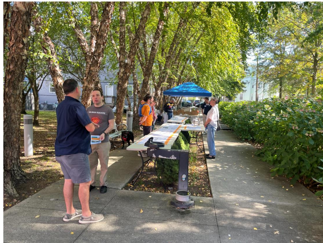
Western Pearl Street Reconstruction project open house at Ed Leathers Park, October 2025