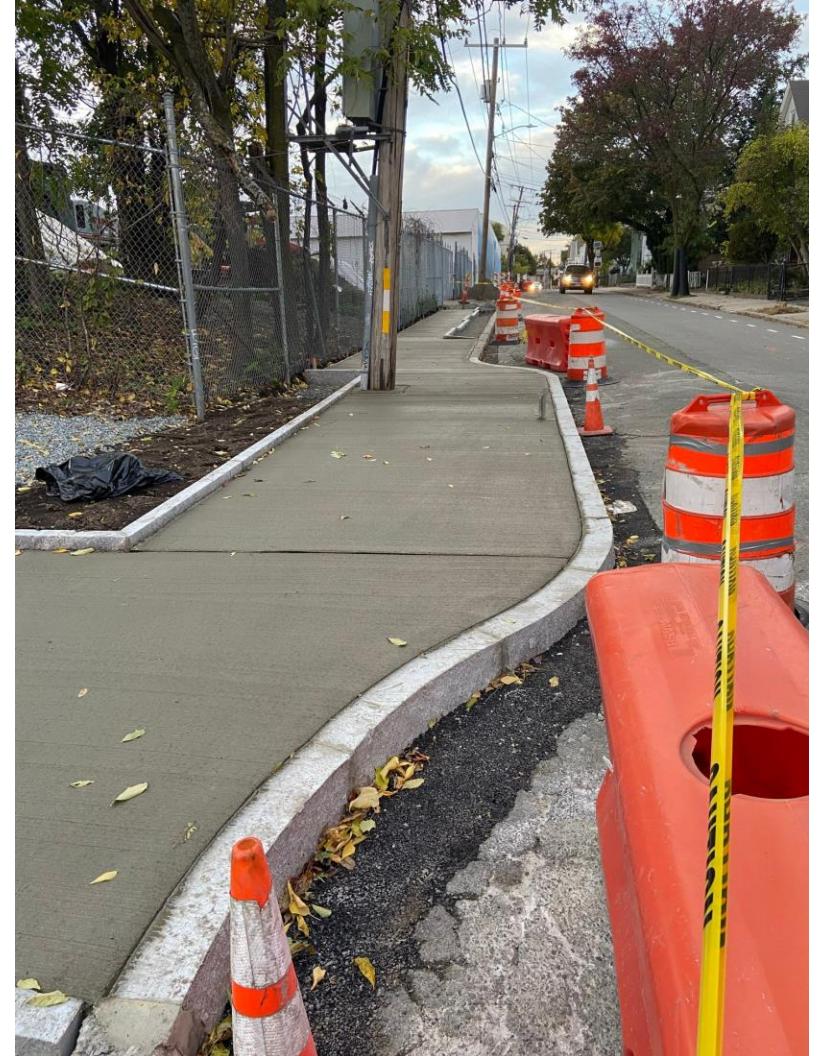
Tufts Street sidewalk construction – October 2025