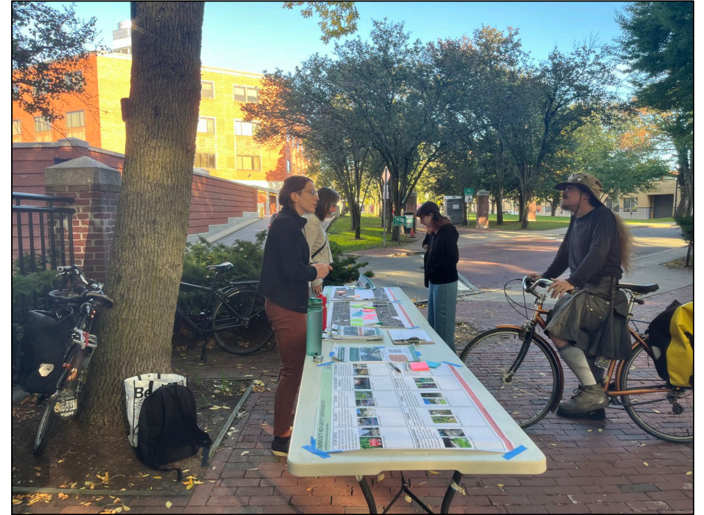
Community Path Safety Improvements Street Pop-up at Buena Vista Road Entrance to the Community Path, September 2025