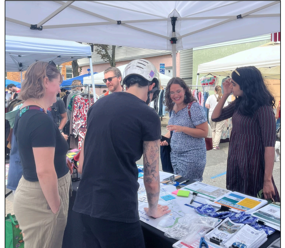
Somerville Bicycle Advisory Committee, Pedestrian and Transit Advisory Committee and OSPCD Mobility Division tabling at the Gilman Square Arts and Music Festival, September 2025