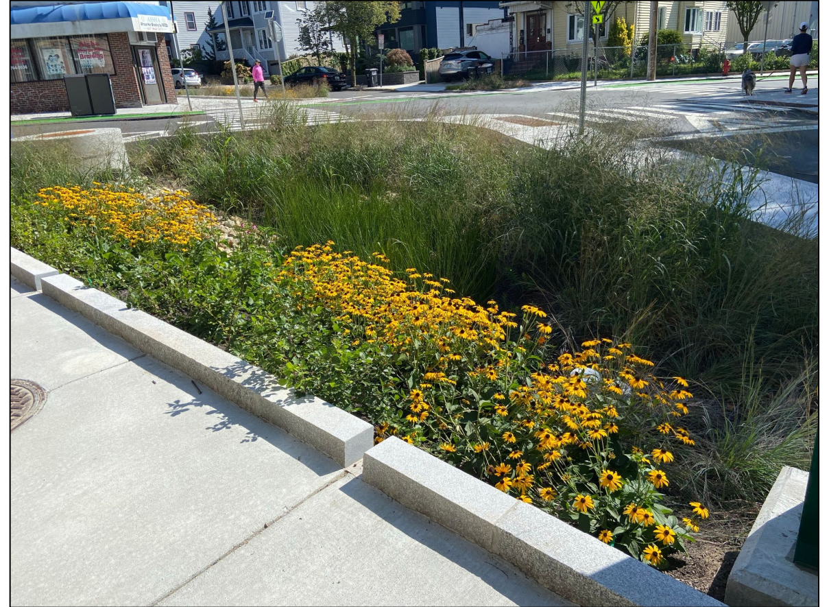
Quincy Street pocket park – September 2025