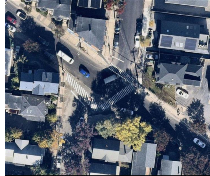
Summer St/Quincy St/Prescott St before (October 2024) and after (July 2025)