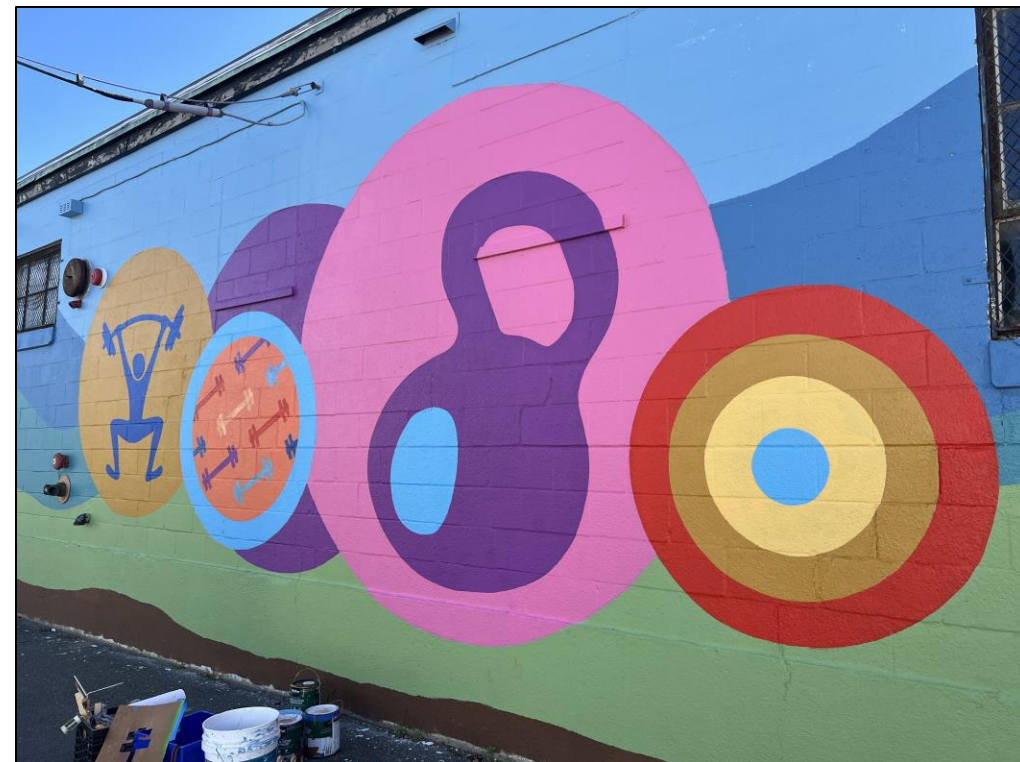
New Tufts Street mural – September 2025