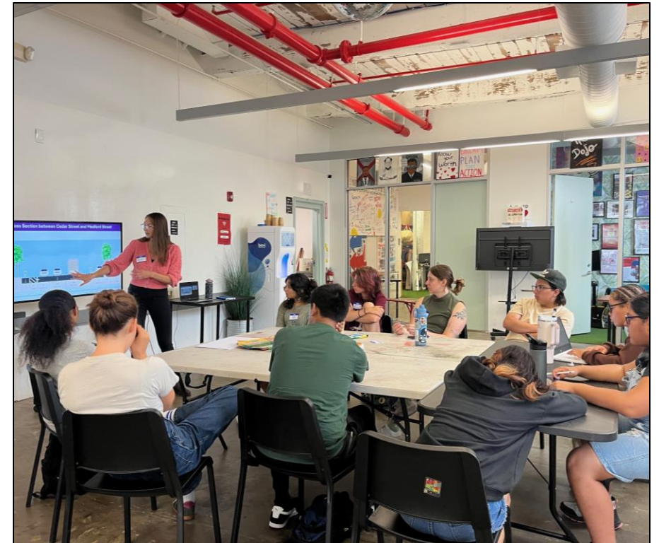
Mobility 101 workshop, Groundworks Somerville Summer Green Team July 2025