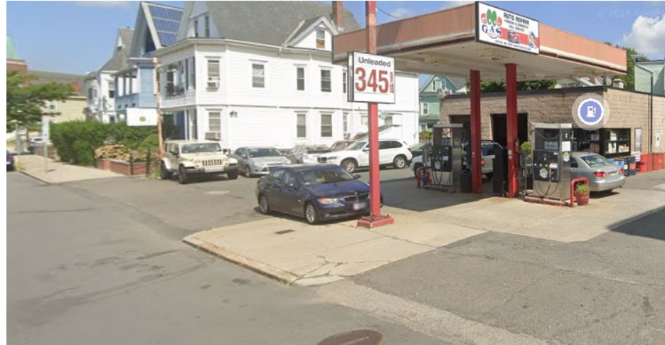
353 Medford Street