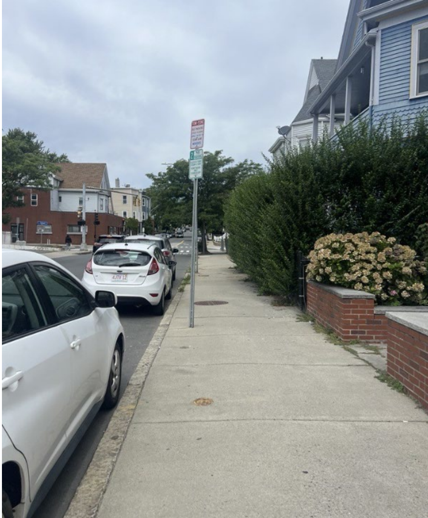
Sign at western end of 355 Medford Street