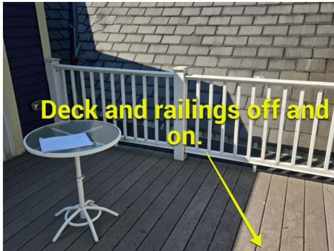
REMOVE DECKING AND RAILINGS AND STORE.