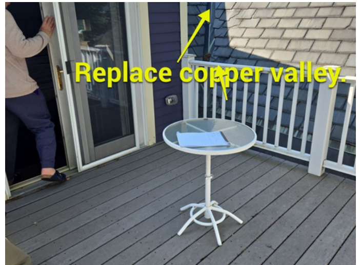
REPLACE COPPER VALLEY. HIGH TEMP ICE AND WATER SHIELD UNDER ALL COPPER.