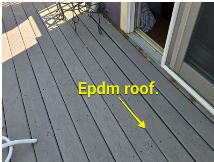
EPDM ROOFING MATERIAL. FLASH WALL TO ROOF JUNCTURE. FLASH EPDM TO SLATE TRANSITION.