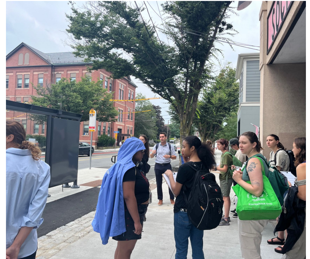
West Washington Street Walk Audit, Groundworks Somerville Summer Green Team, July 2025