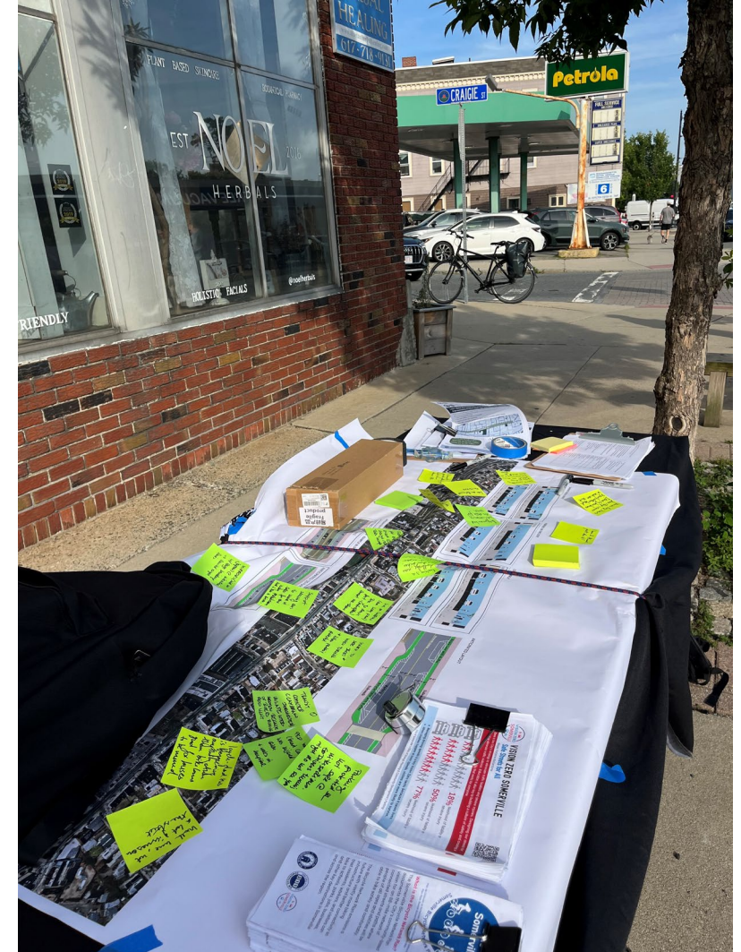
Somerville Ave quick-build project pop-up at Wilson Square, June 2025