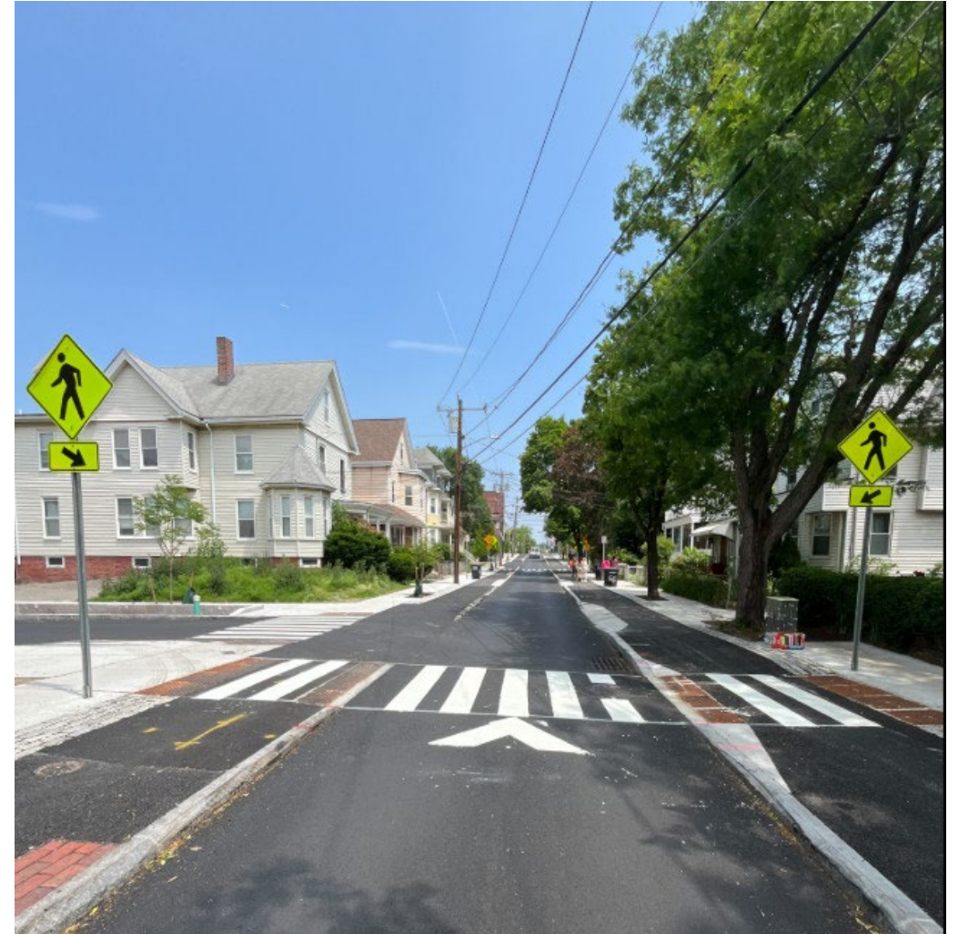
Cycle tracks and raised crossing on Central Street, June 2025