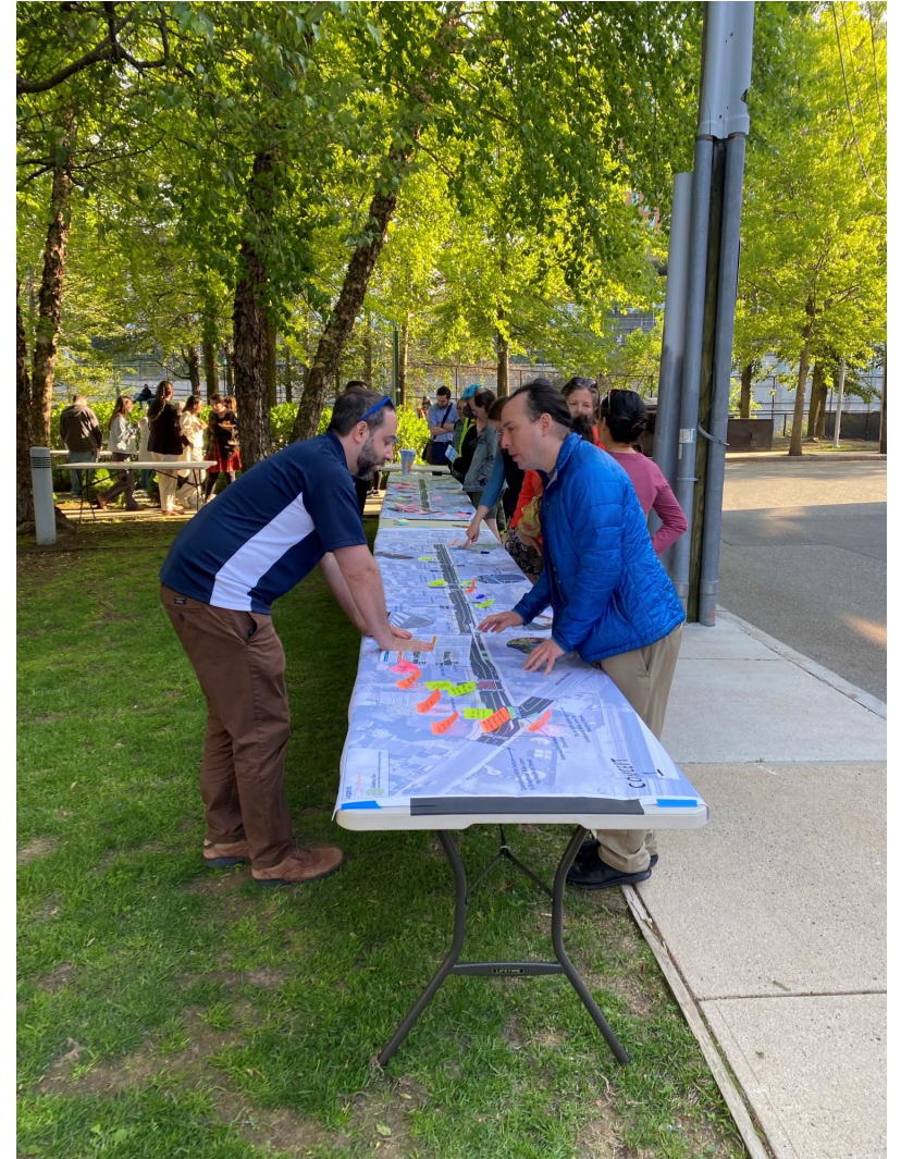
Western Pearl Street Reconstruction Project Open House, May 2025