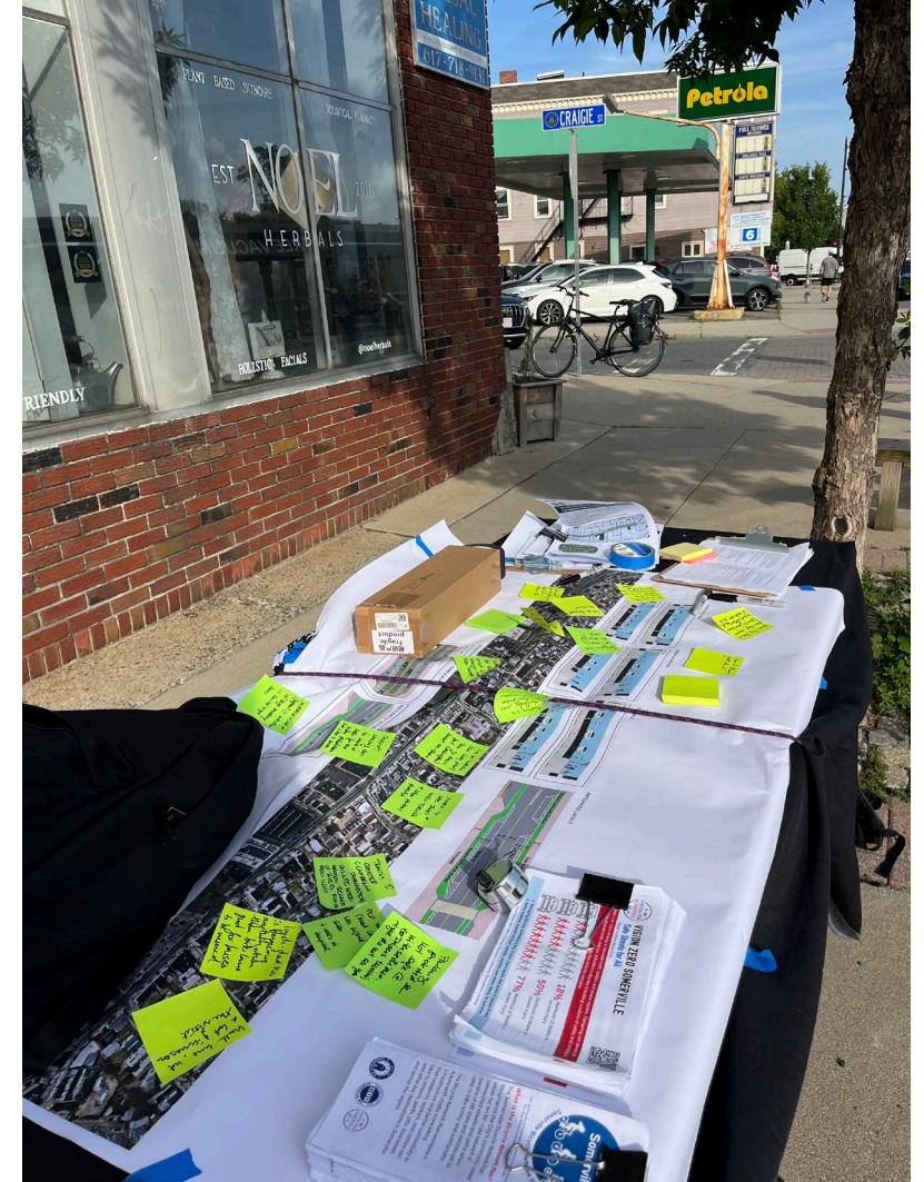
Somerville Ave quick-build project pop-up at Wilson Square, June 2025