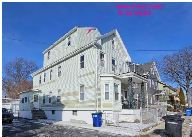
Right: Rear Elevation