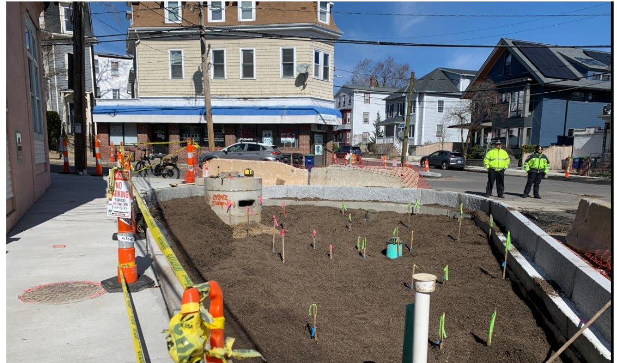
Under construction: Bioretention basin at Quincy and Summer Streets – April 2, 2025