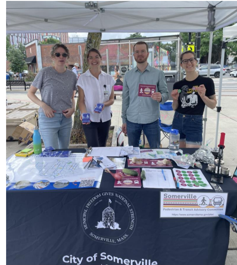
Pedestrian and Transit Committee at Union Square Farmers Market