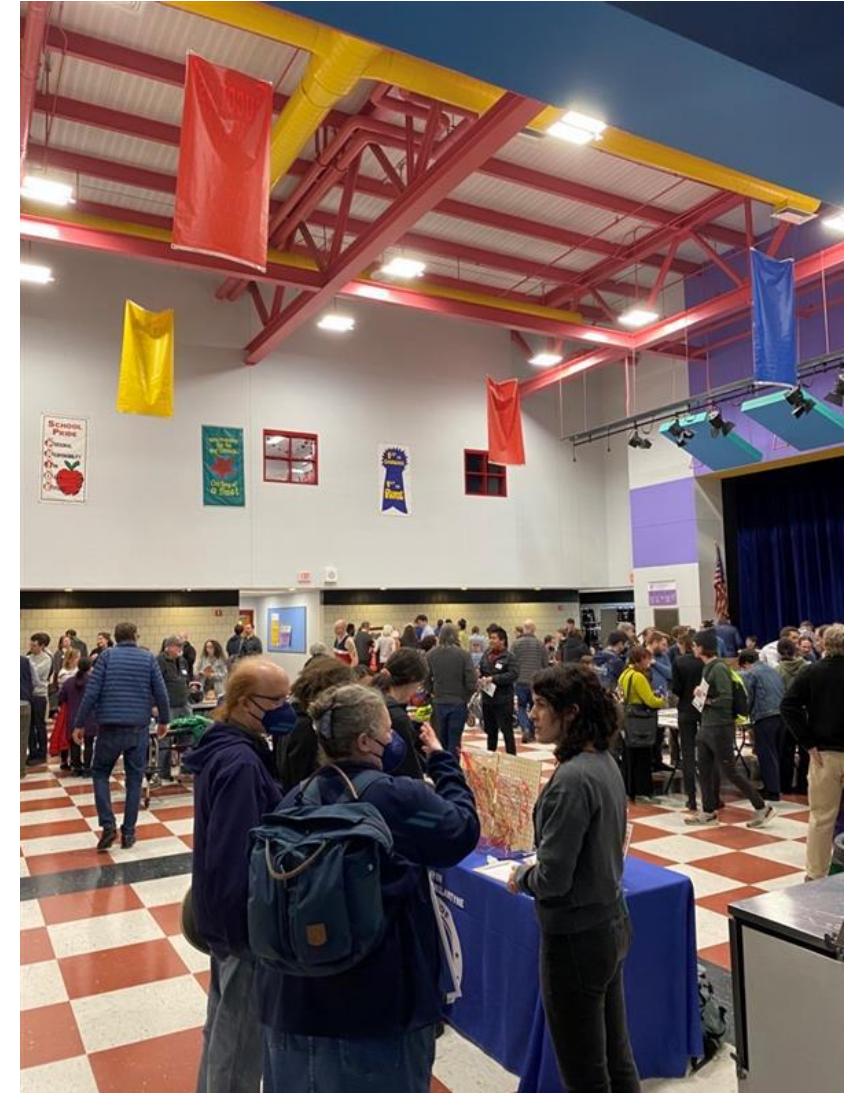
Elm-Beacon Connector Concept Design Open House – March 10, 2025