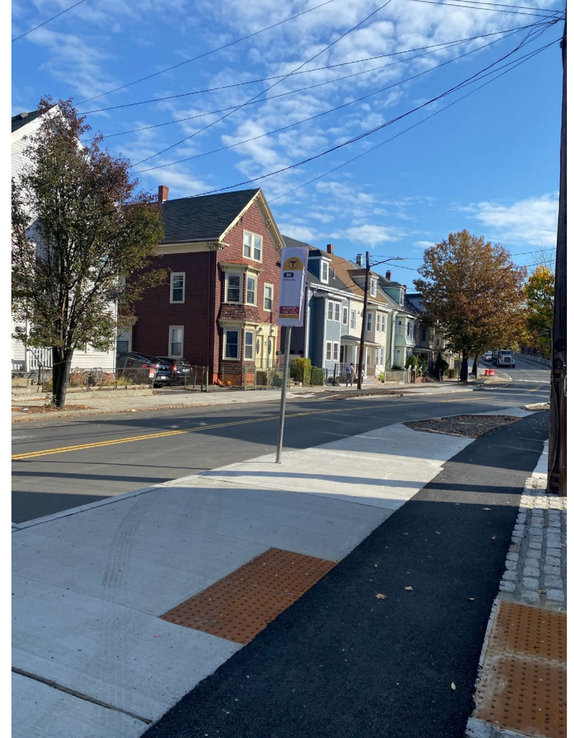
Western Washington Street - November 2024