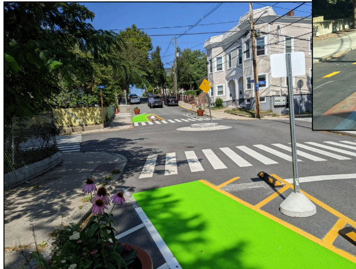
Neighborway treatments on Glen St at Oliver St