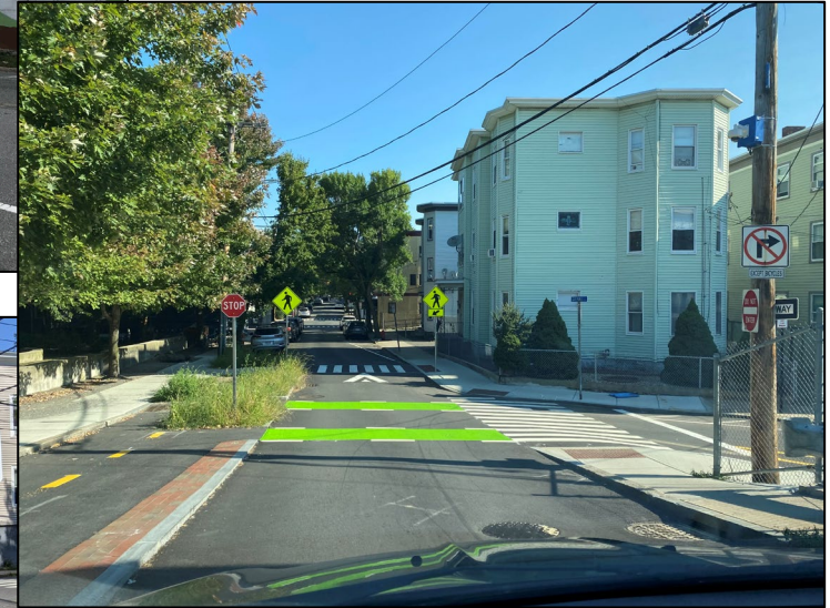
Walnut St two-way bike facility