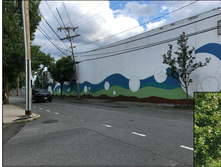
Tufts Street Mural