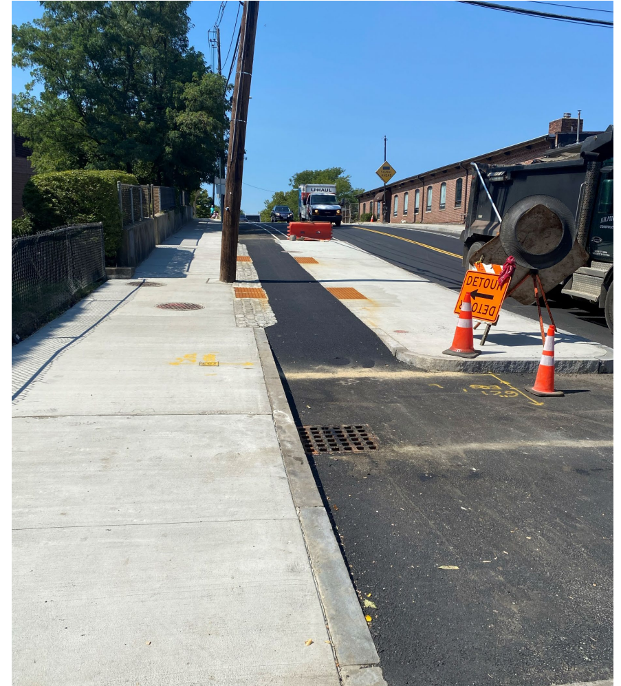
Floating bus stop in Construction on Washington St opposite Hawkins St, September 2024