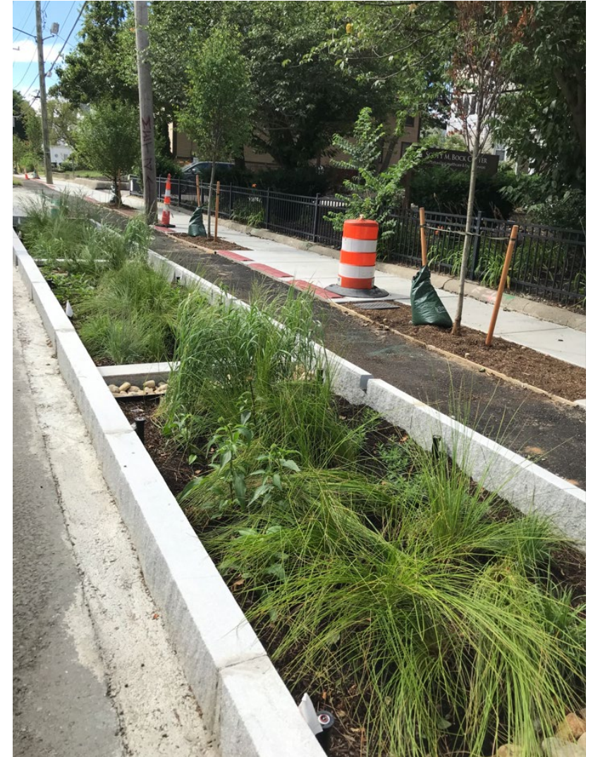
Spring Hill Construction – Summer Street – July 2024