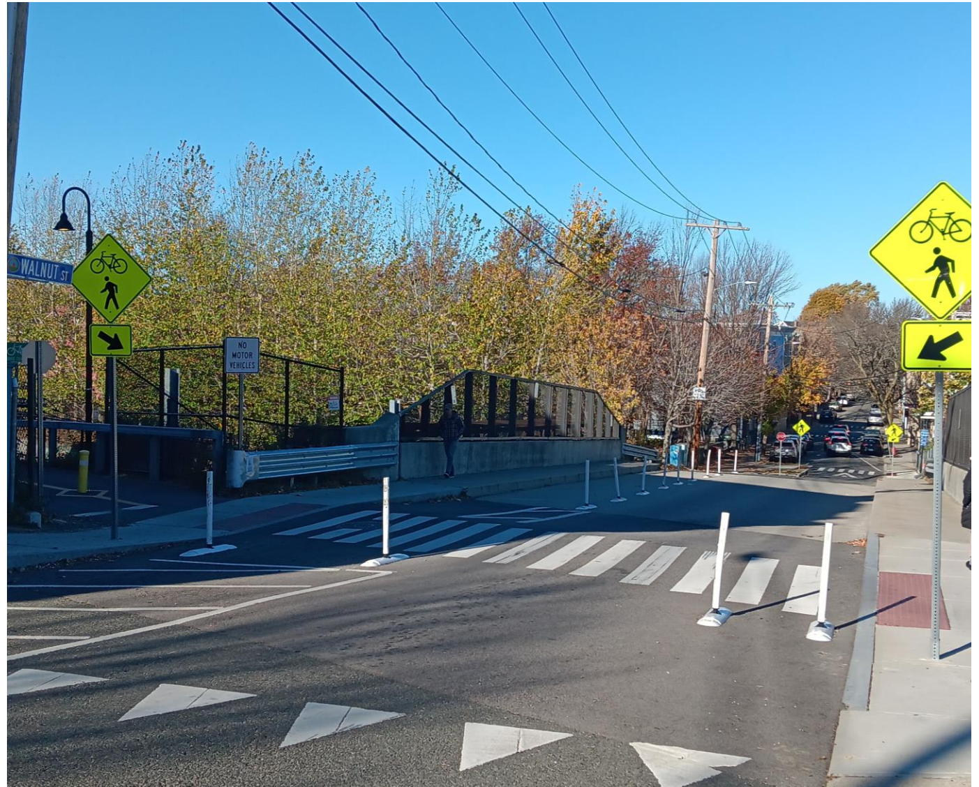
Existing Conditions – November 2024