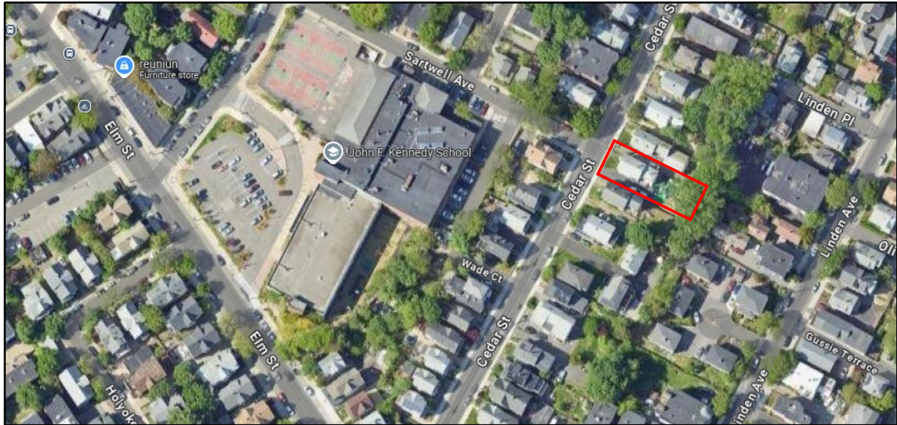
Above: Context Map for 35 Cedar Street.