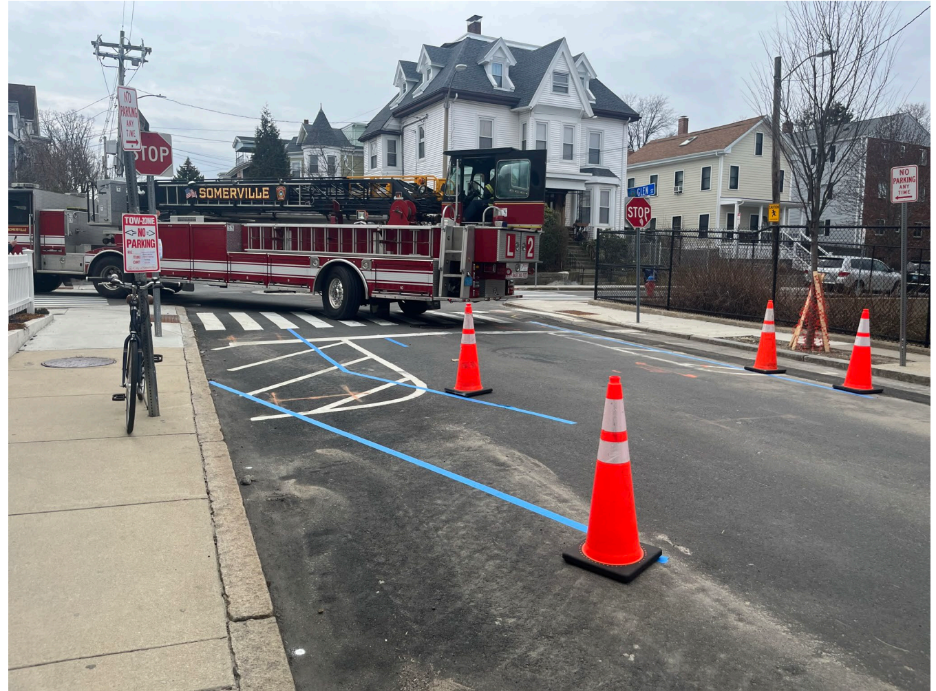
Gateway Demonstration at Glen Street and Pearl Street – April 2 nd , 2024