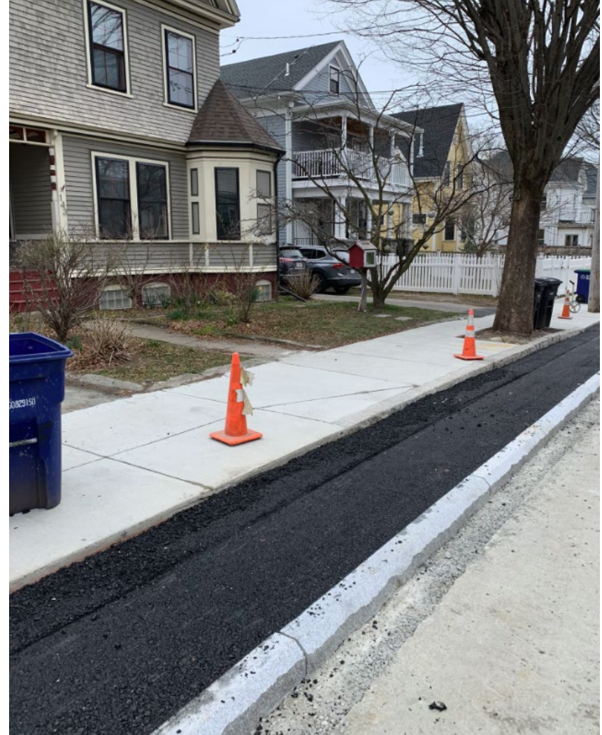
Spring Hill Construction – Summer Street – April 2024