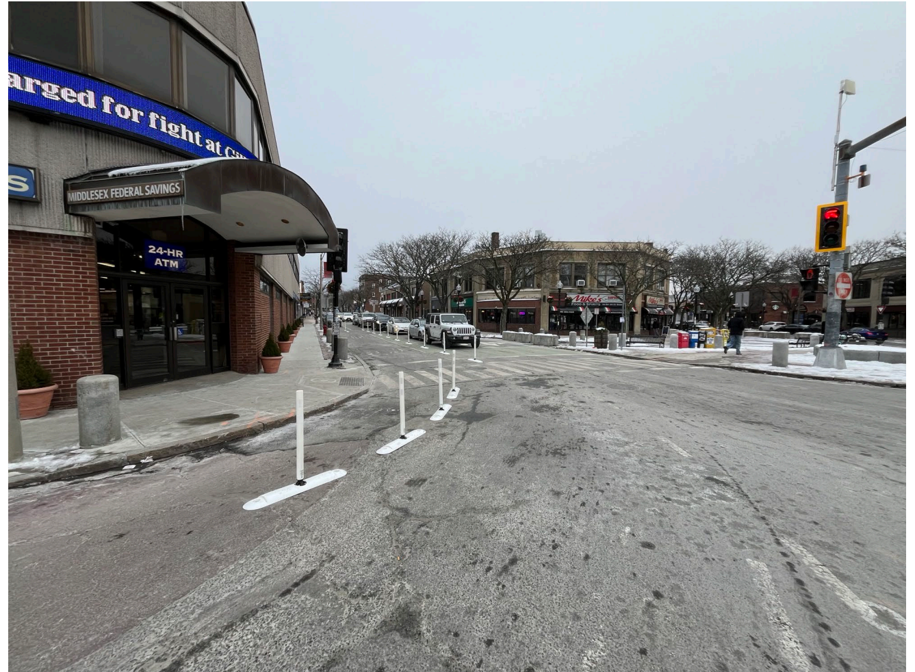
Davis Square – Highland Ave and College Ave - January 2024