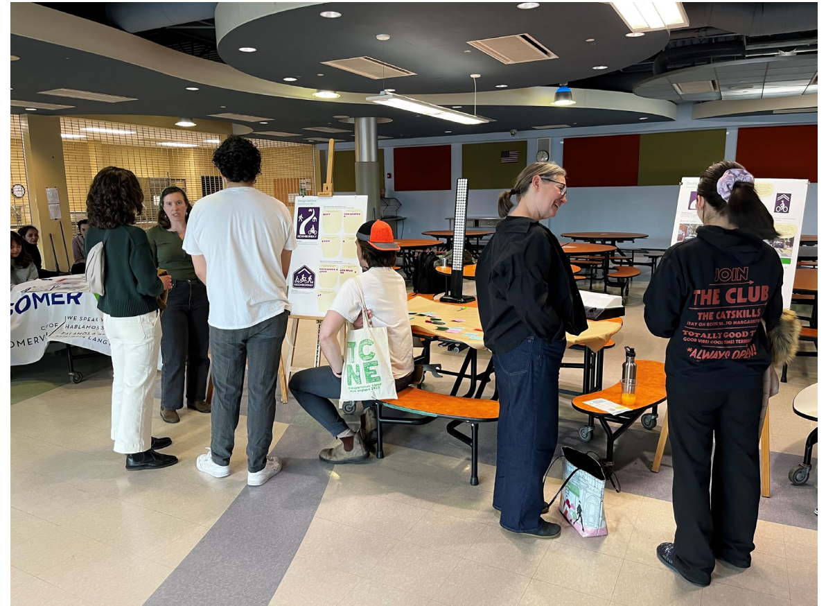
Glen Street/Otis Street Neighborways Pop-Up – March 16 th , 2024