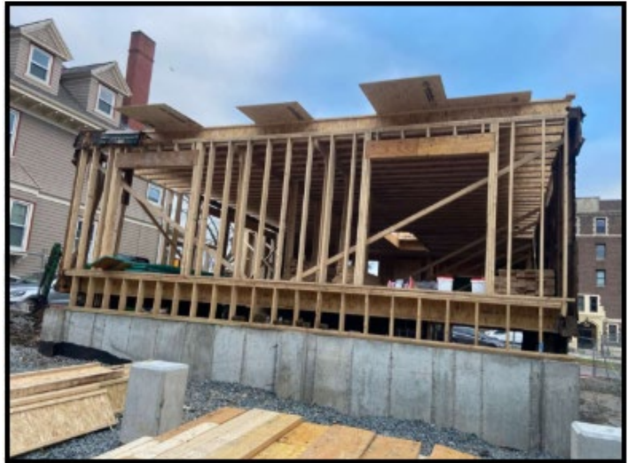
Right: Right Elevation