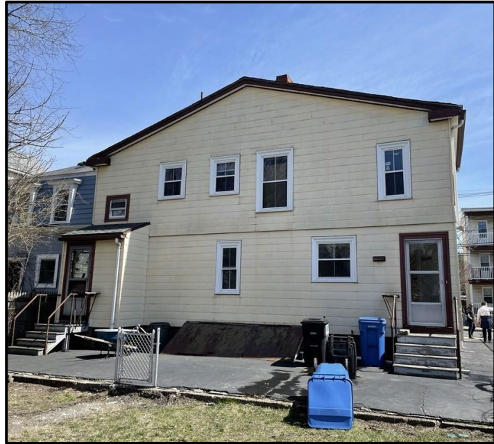
Right: Right Elevation (partially demo'ed)