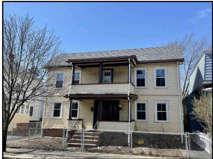
Right: Left Elevation (partially demo'ed)