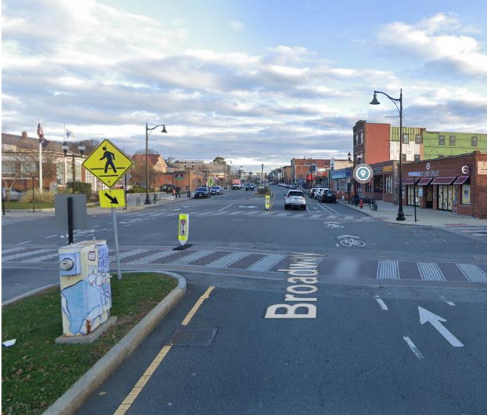
Broadway @ Glen St / Michigan Ave