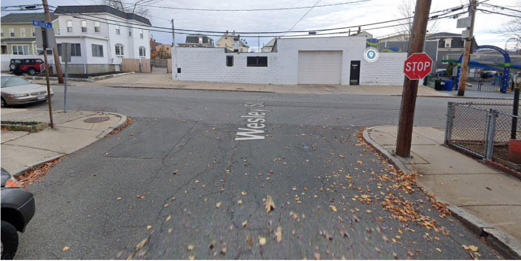
Wesley Park @ Otis St

Unmarked crossing locations with curb ramps shown below