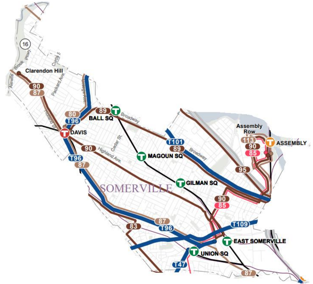
Fall 2022 MBTA Bus Network Redesign Map in Somerville