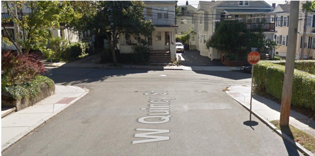
W Quincy St @ Bailey St