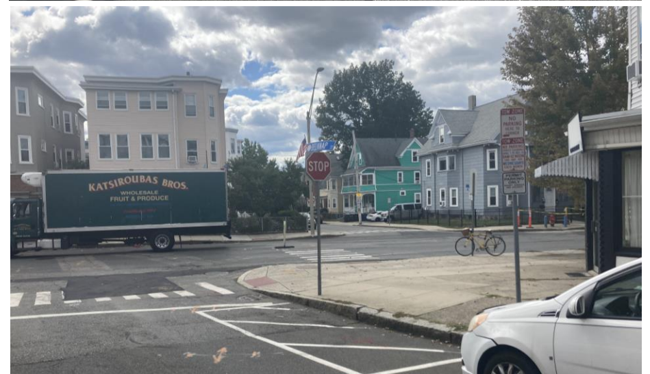
Daylighting at Belknap St & Broadway