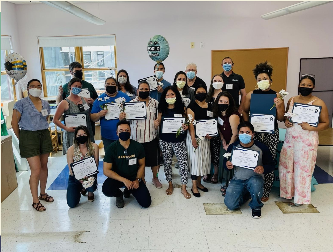
Leadership Development Institute (LDI) Graduation – May 2022