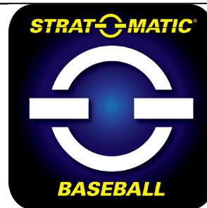
The Card Viewer app icon

Use it to find games and accessories. Use it to get up to speed on new ways to enjoy the hobby, such as Baseball and Football 365, Baseball Daily, the amazing Card Viewer app and the new Fantasy Predictor app. Use it get the latest word on Strat-O-Matic's ever-expanding line of cards and Windows rosters. For new orders, easiest access is click the New Products page under the baseball tab.