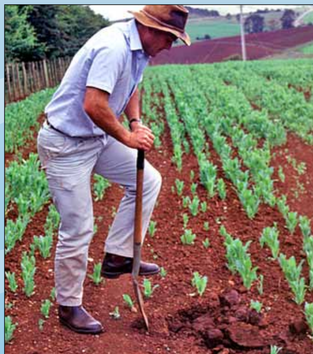
Assess soil structure by digging holes.

Good structure is characterised by many rounded, irregularly shaped aggregates of 2–10 mm diameter, with larger aggregates having rough surfaces and many holes for good aeration. Aggregates have rough surfaces which are often broken by crop stubble and other plant residues. Poor structure is characterised by large firm clods of 20–100 mm diameter, that are angular with smooth faces and no pores. The clods and overworked soil break into loose, fine powdery soil. Degraded soil is hard to dig, crusting is often visible following sealing by rain, particularly on sandy loam textured soils and surface water ponding occurs. It is important to note that abundant actively growing fine plant roots need to be present in a soil to get a score of 10. This is because plant roots are intimately associated with forming and maintaining soil structure.