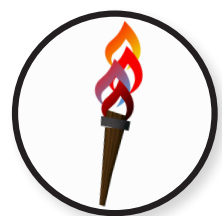
The Awakening Logo