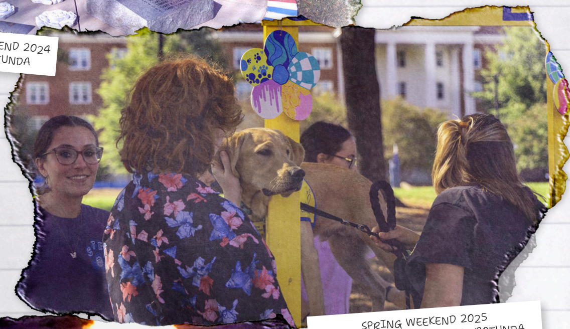
SPRING WEEKEND 2025