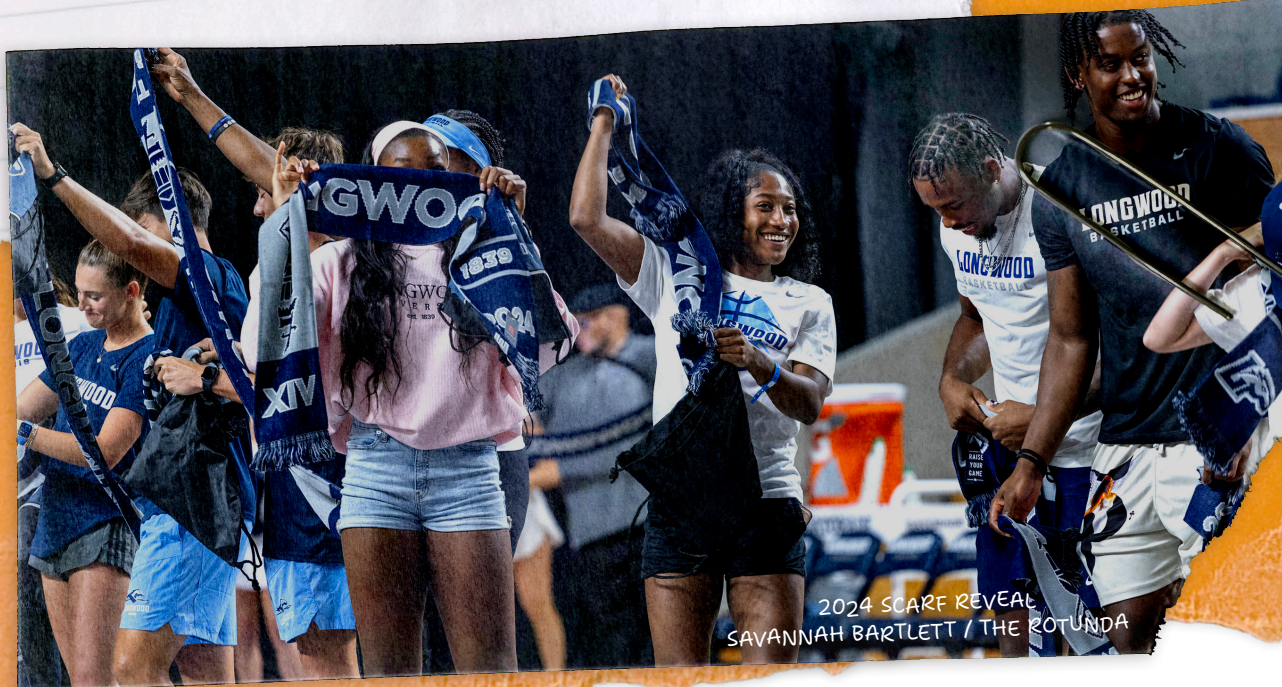
2024 SCARF REVEAL