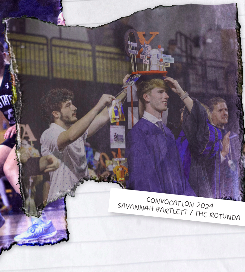
CONVOCATION 2024