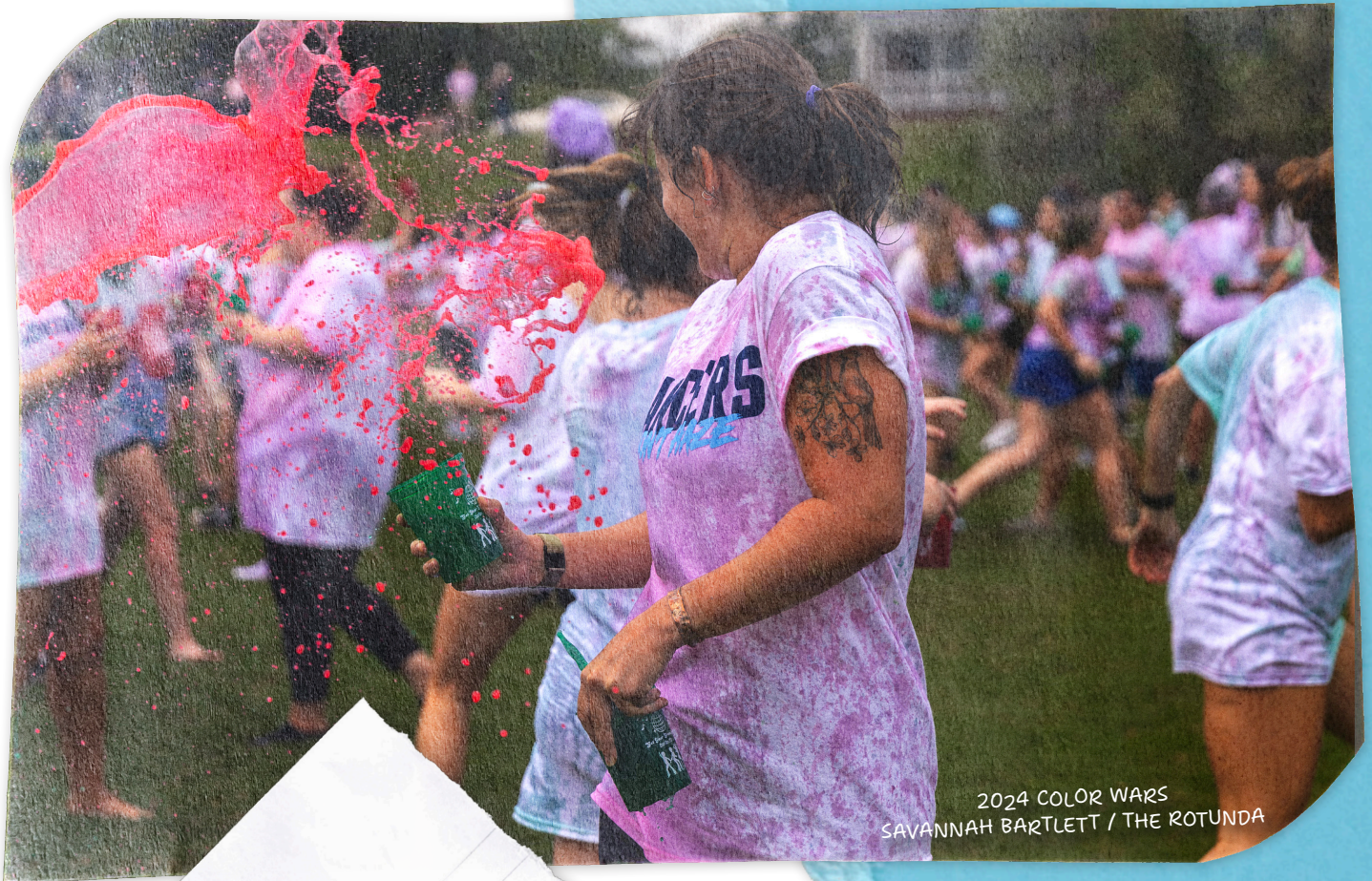
2024 COLOR WARS SAVANNAH BARTLETT / THE ROTUNDA