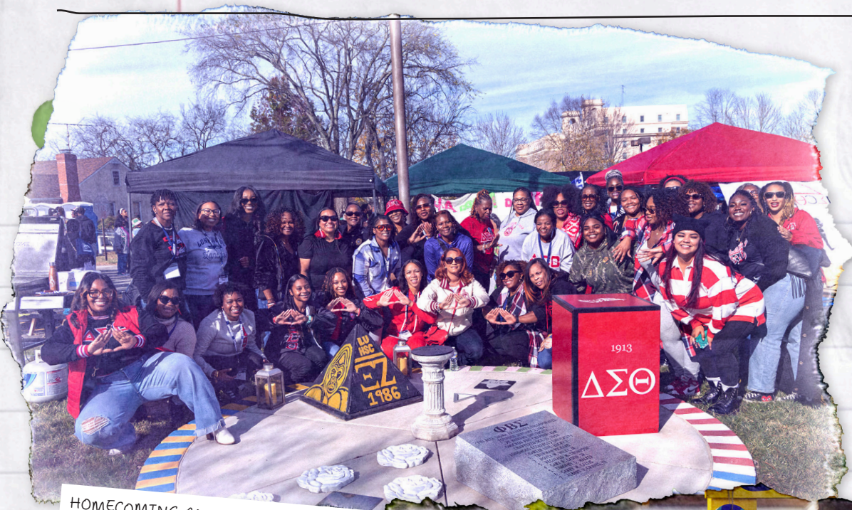
HOMECOMING AND ALUMNI WEEKEND 2024