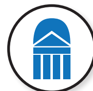
CHI Rotunda Symbol