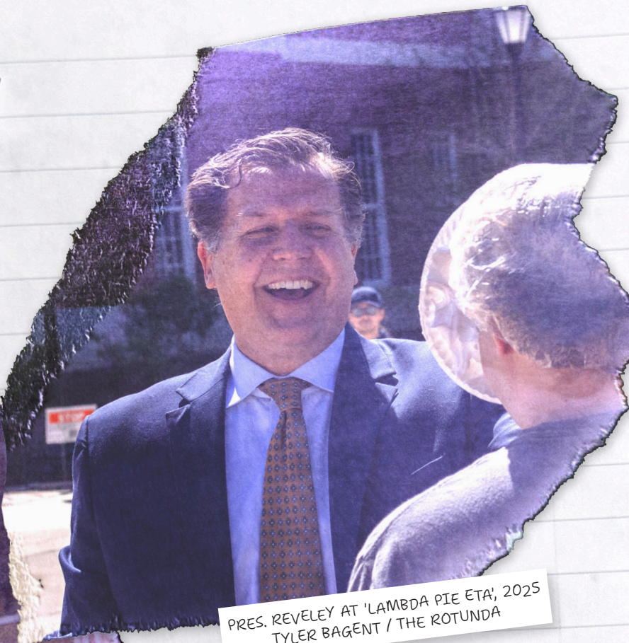
PRES. REVELEY AT 'LAMBDA PIE ETA', 2025