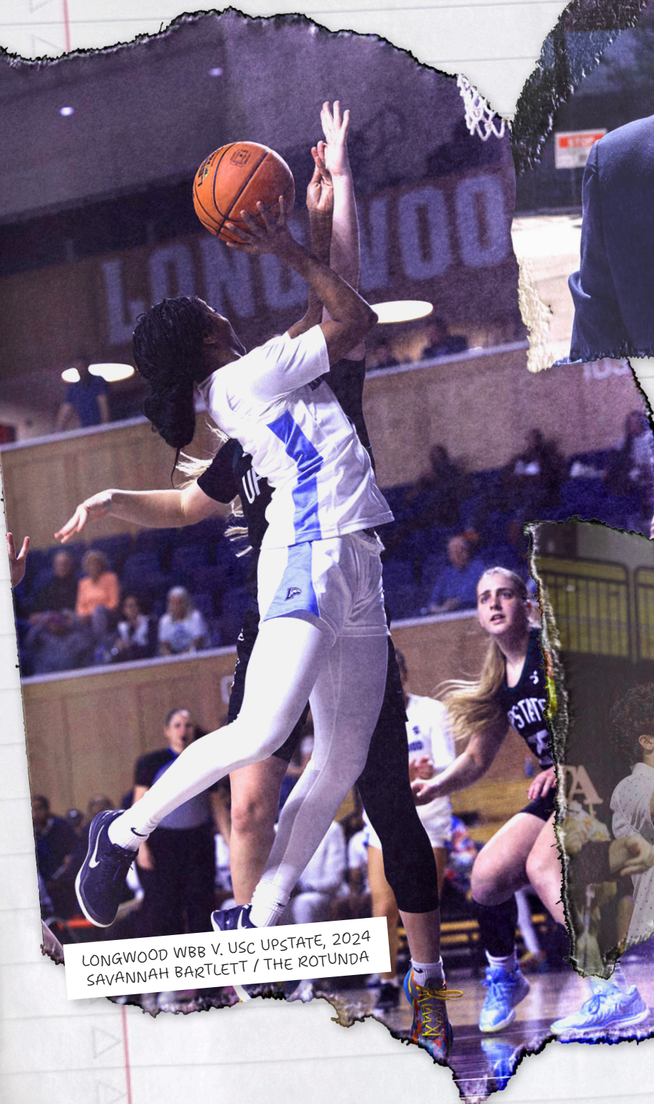
LONGWOOD WBB V. USC UPSTATE, 2024