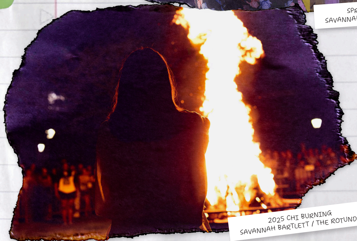
2025 CHI BURNING SAVANNAH BARTLETT / THE ROTUNDA