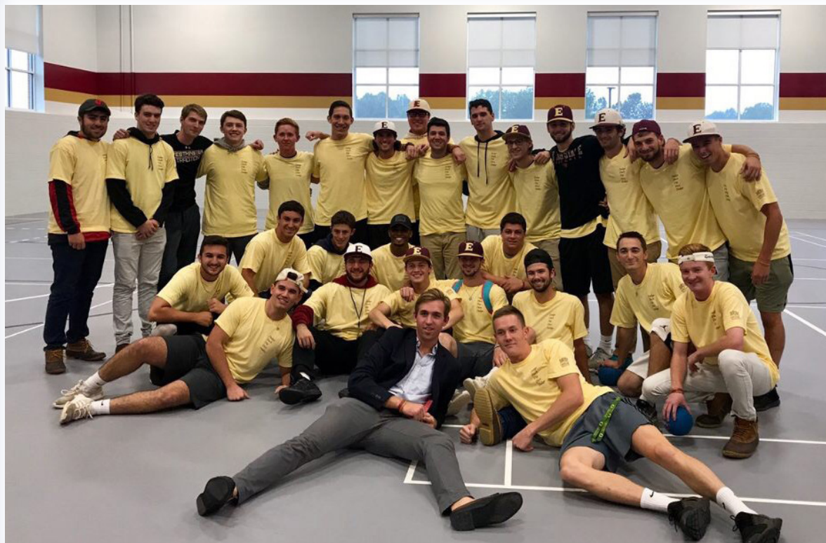
Members of the Elon University club baseball team gather for a group photo after a fundraising event last year.