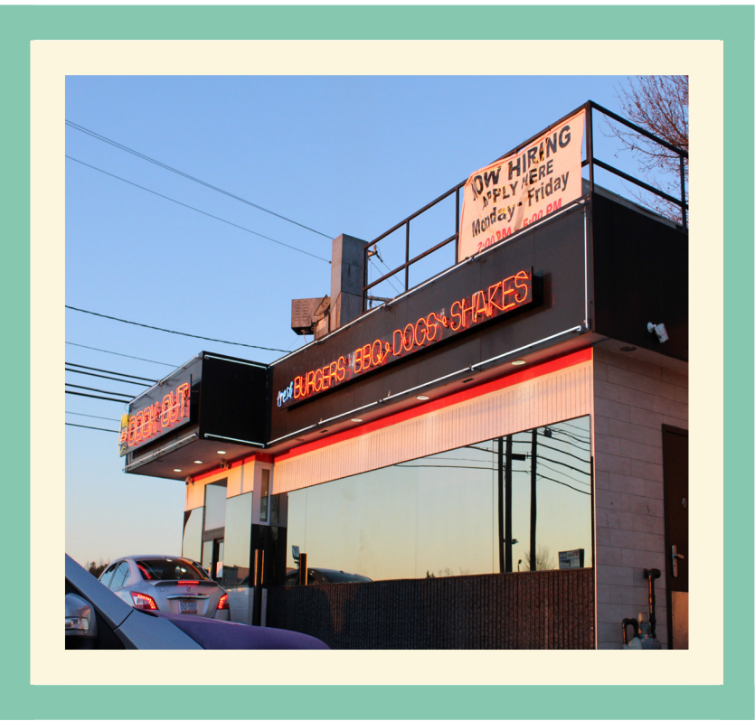
Cookout on Huffman Mill Road in Burlington is frequented by Elon students.