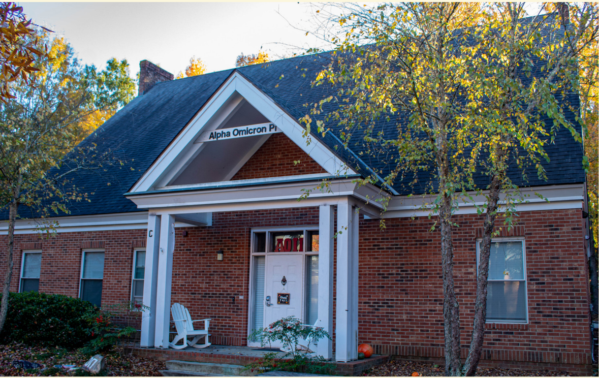
The Alpha Omicron Pi house in Loy Center Neighborhood, a residential community for sorority and fraternity involvement.