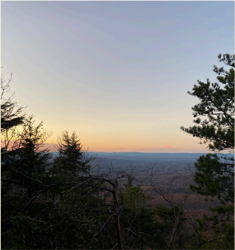
View from an outlook in Asheville, North Carolina.

"Some of the restaurants will stay open every day and so you can always go, you never miss it," Gibbons said. "There's just so many great places in Asheville to visit, and it's only about three hours away."