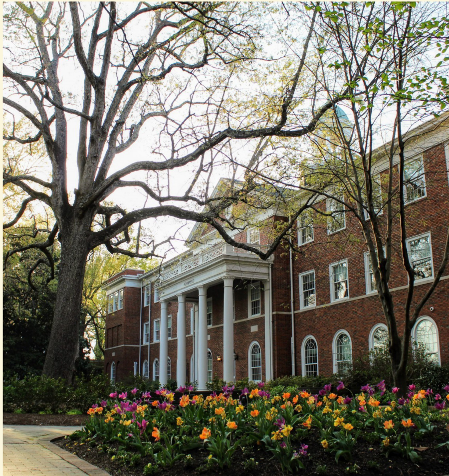
Tulips bloom near the south side of the Alamance Building on Apr 7, 2021.

If you consider fall to be the best, just wait until spring comes. You might just change your mind.