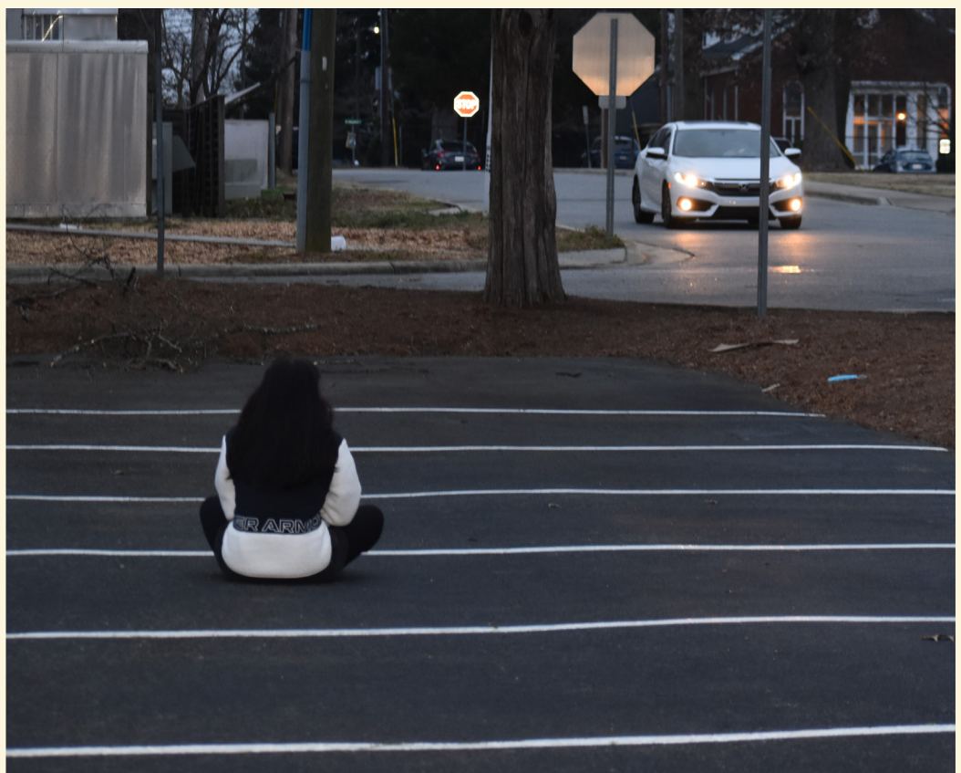
Not having a car — or driver's license — forced me to spend almost all of my time on Elon's campus, but it helped me appreciate being here.

Going to Elon and not having personal transportation has taught me patience. Waiting for buses, Ubers and friends was a part of that. Most of all, I learned that it's okay to rely on other people, but also how and when to be self sufficient. Now, being at Elon without a car isn't all that bad — but I'm still going to learn how to drive and save up for one.