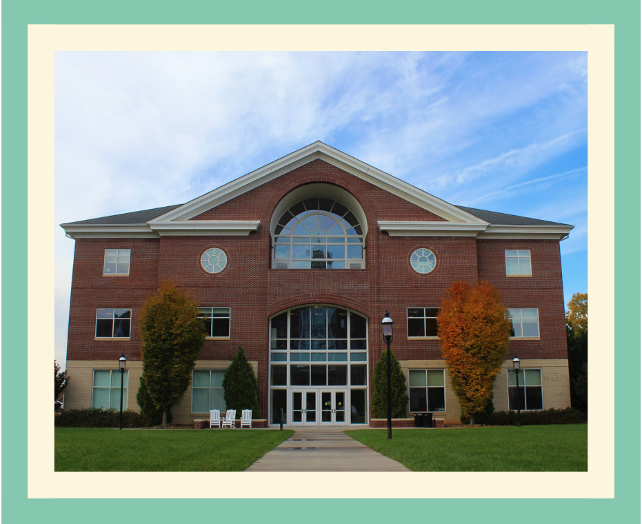
Global Commons, a study hall and common building, is located in the center of Global Neighborhood.