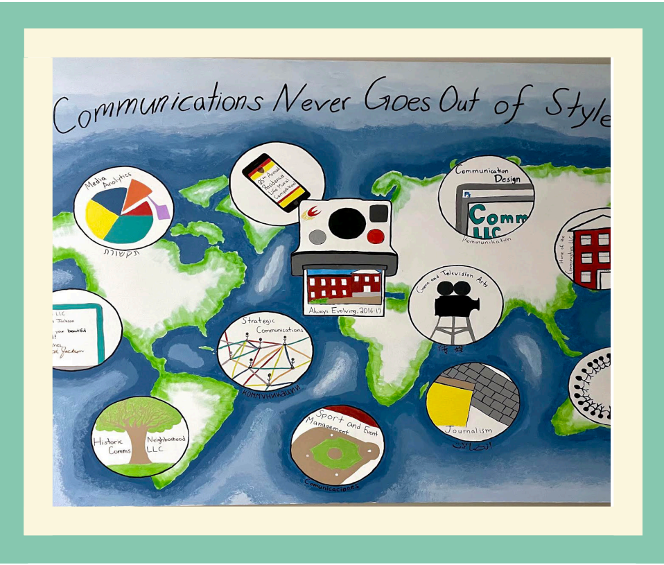
Mural in the hallway of the Communications LLC located on the first floor of Sloan Residential Hall.