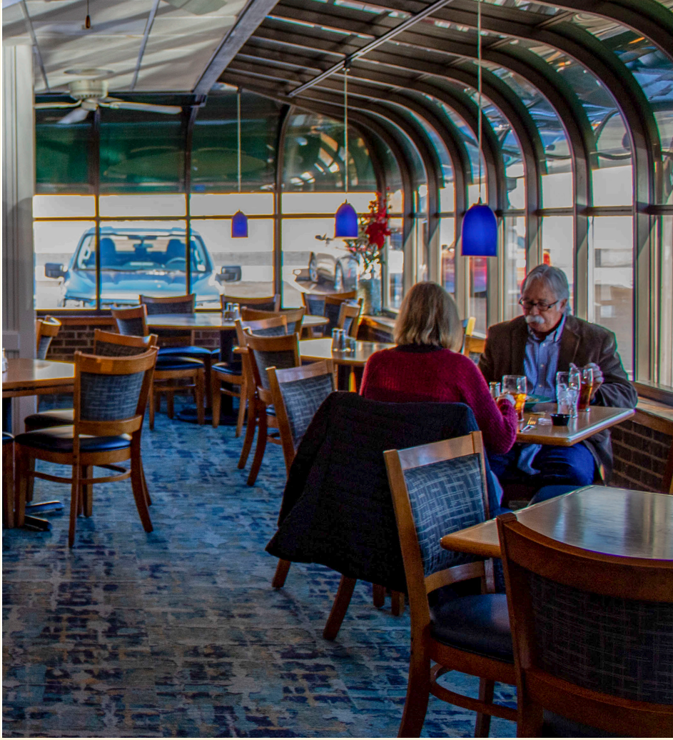
Diners eat inside the Village Grill on Jan. 4 in Burlington.