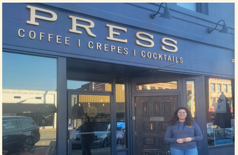
GRACEANNE GAUDIELLO | STAFF PHOTOGRAPHER