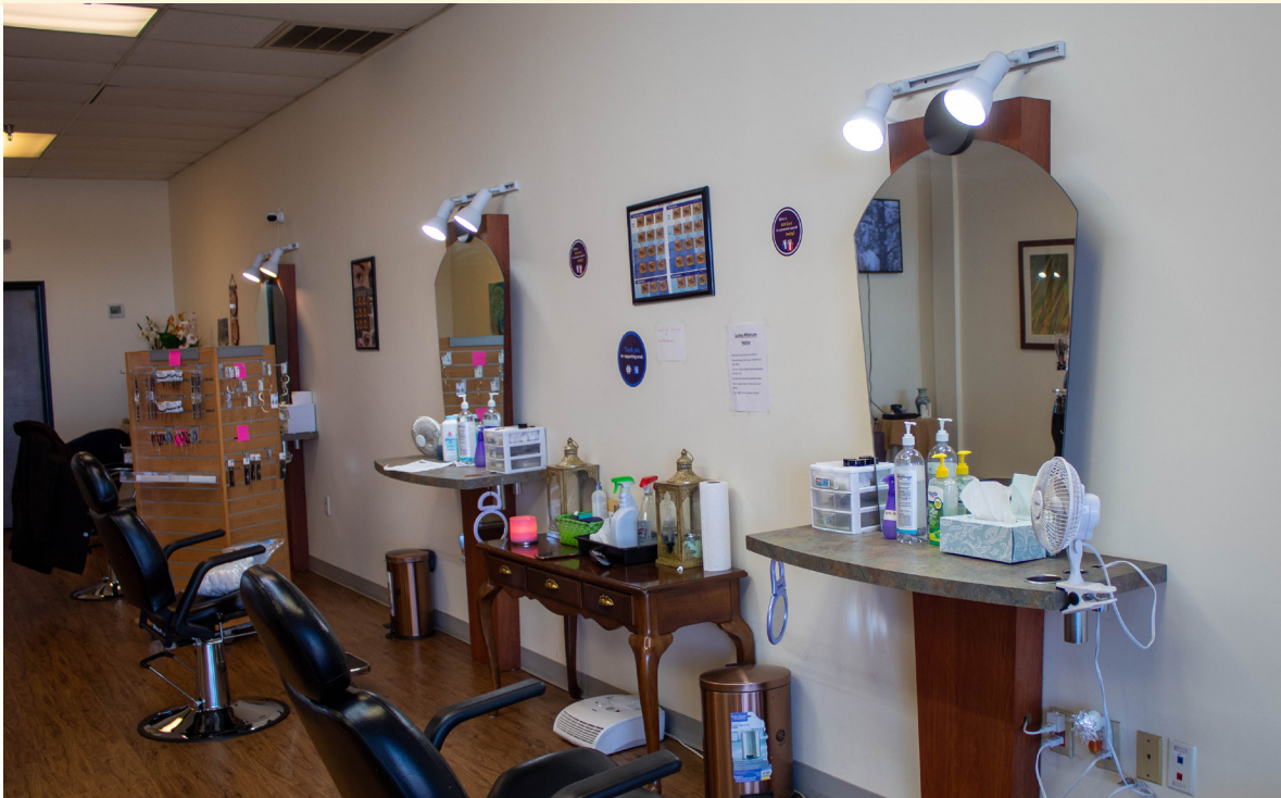
Inside the salon at Brow N' Brow, located in Burlington.

According to Tara, the package programs Brow N' Brow offers, such as its three months unlimited plans, help customers save money, especially students.