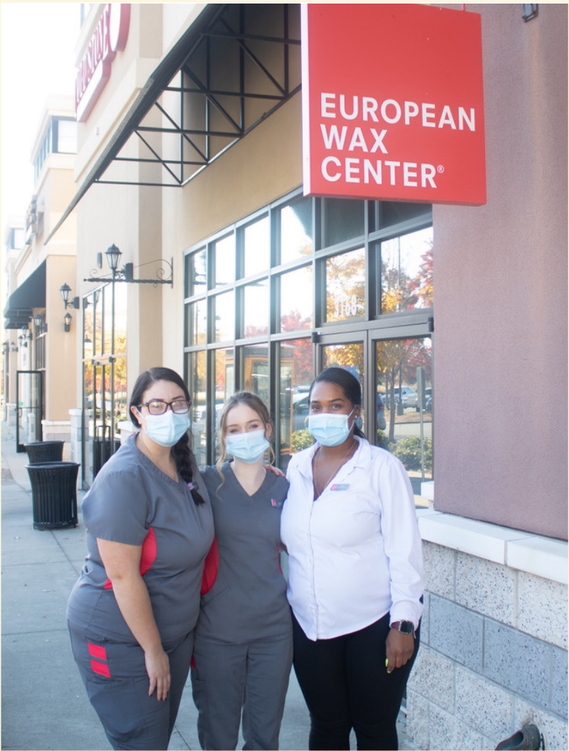
Employees stand in front of European Wax Center’s Burlington location.

Next time you need a wax, check out https://waxcenter.com/ and schedule an appointment at the Burlington location.