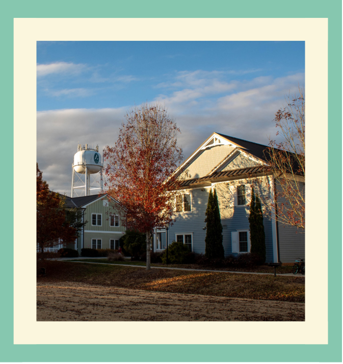
Station at Mill Point apartments, where older students can live on campus.