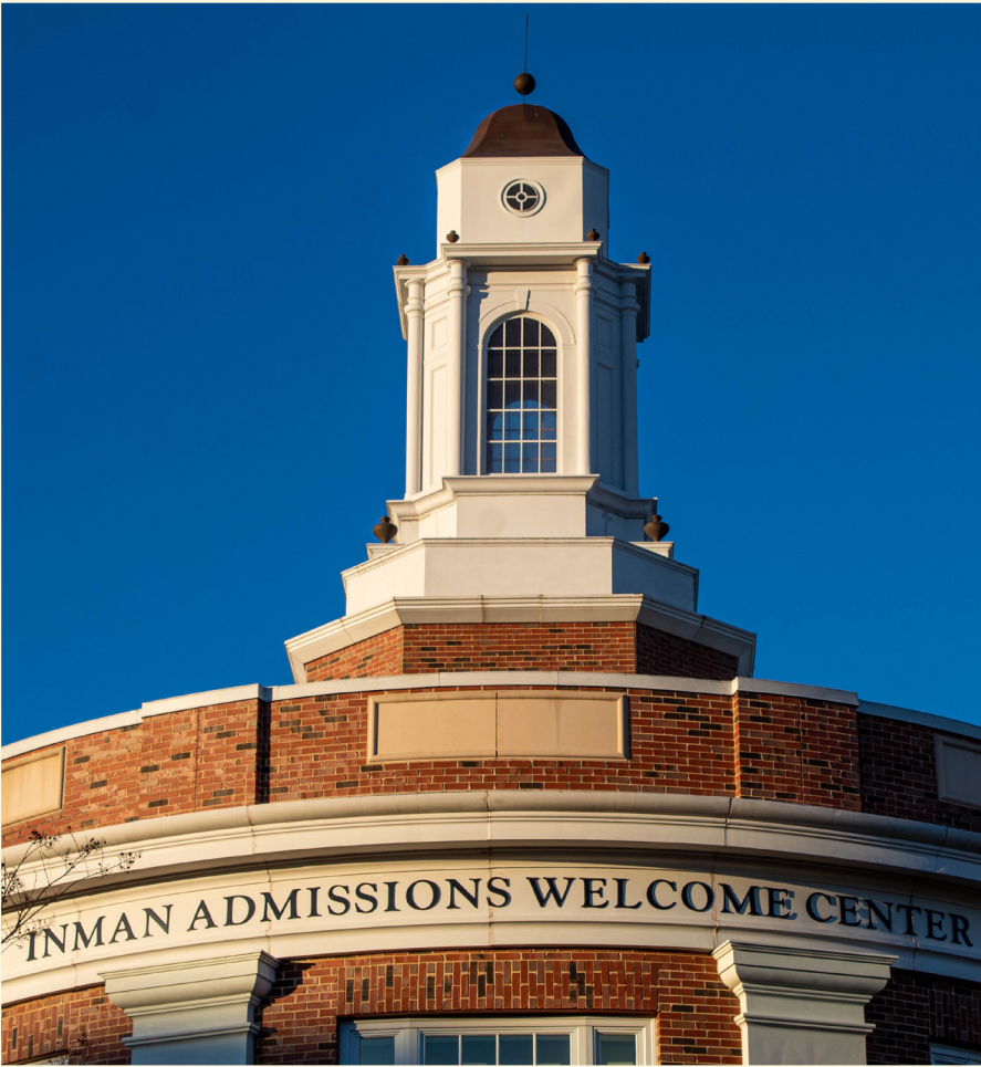
Inman Admissions Welcome Center.