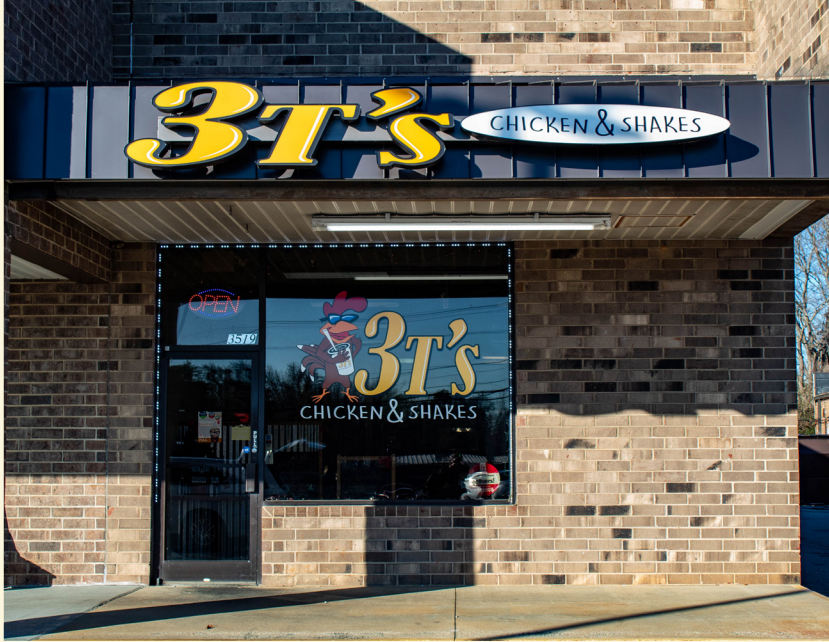
3T’s Chicken & Shakes storefront in Burlington.

Where: 3519 S Church St. Burlington, NC 27215 When: Monday – Saturday: 11 a.m. – 9 p.m. Sunday: Closed