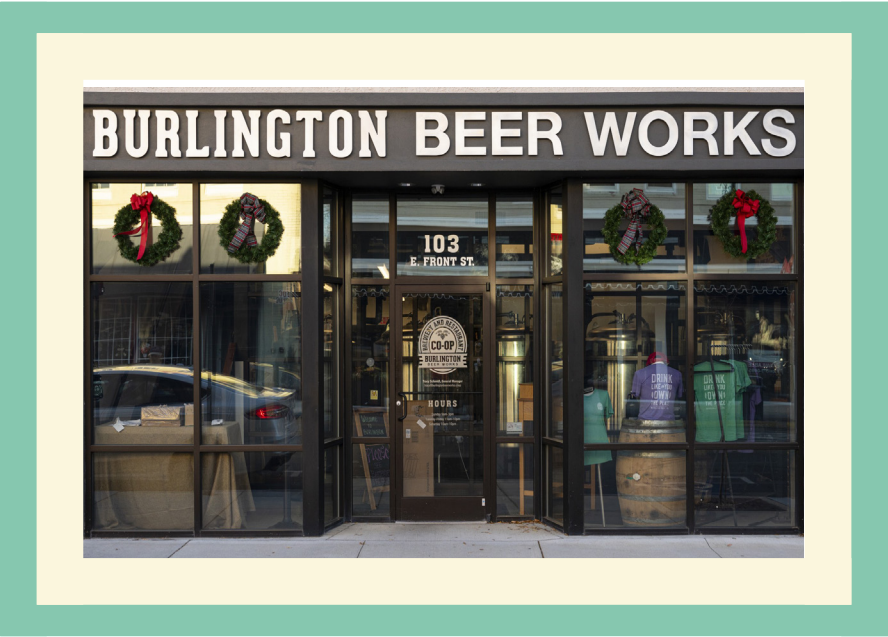
Burlington Beer Works located in downtown Burlington.