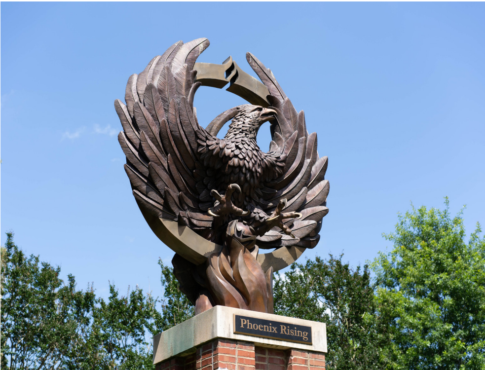
CLARE GRANT | PHOTO EDITOR