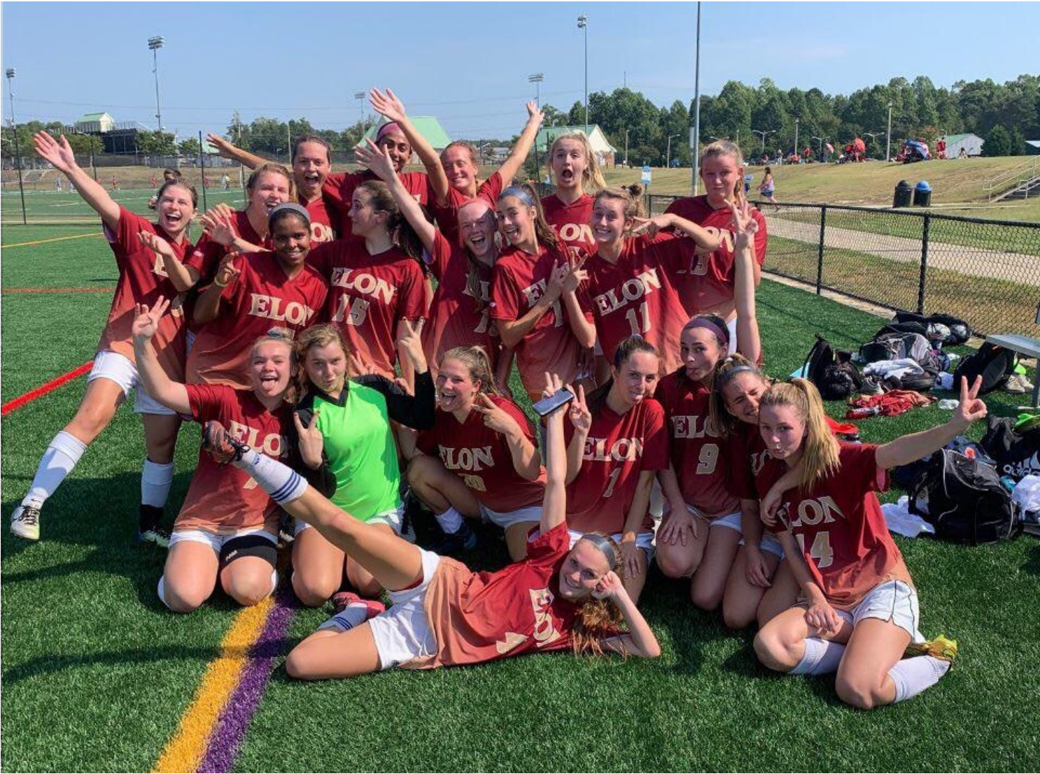
Elon women's club soccer team at a game.