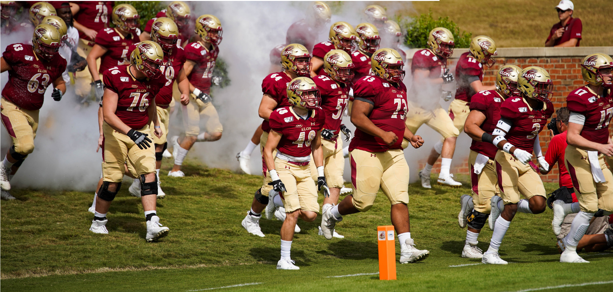
The Phoenix running onto the field for their game against the Delaware Blue Hens in Rhodes Stadium on Oct. 12, 2019. The Phoenix beat the Blue Hens 42-7.