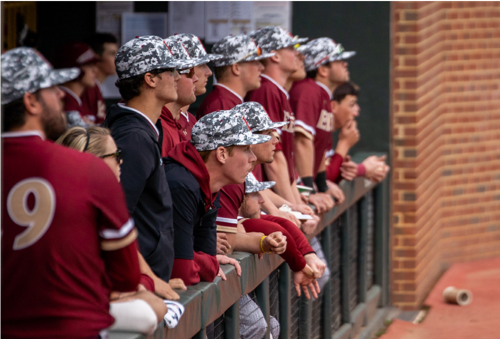
The Elon University baseball team watches the game against the University of North Carolina Tarheels at UNC in Boshamer Stadium on Tuesday, Feb. 18. The Phoenix lost to the Tarheels 7-1.