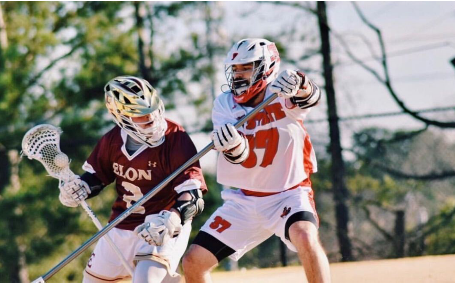
Elon men's club lacrosse in a match.