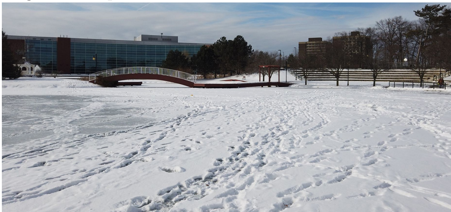
The Student Center following the first snowfall of the year.