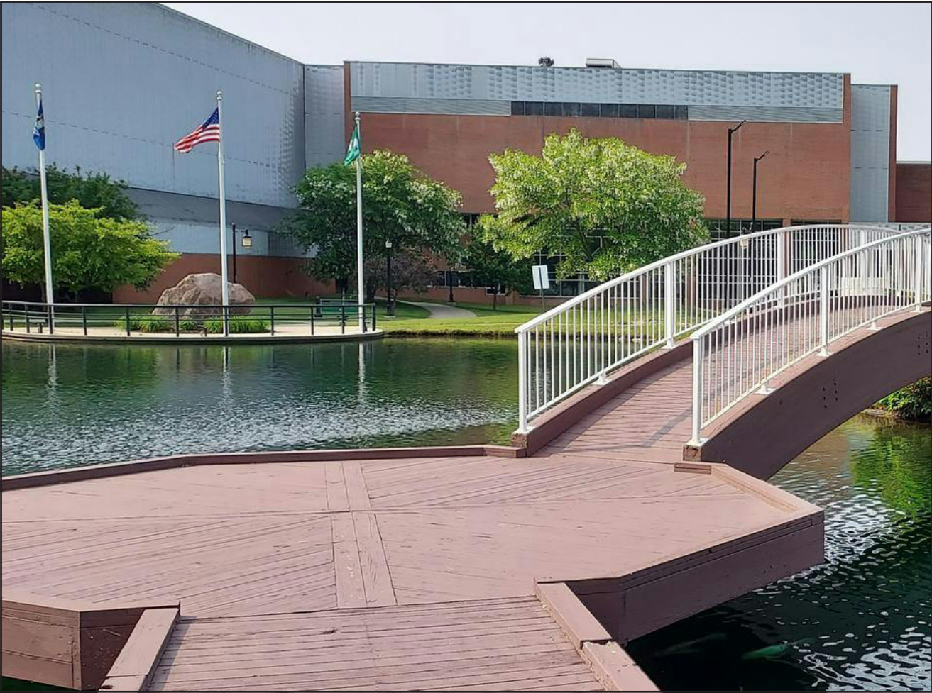
University Pond in front of the Student Center is home to koi fish and geese.

There are several websites and stores where students can purchase EMU merchandise to show off their school pride. For instance, Barnesmith sells college apparel such as sweatshirts, shirts and hats for more than 100 different colleges and universities, including EMU. Underground Printing also sells EMU apparel and offers free shipping for all orders over $75. Rally House is another place to find EMU merch, and there are several locations close to campus. In addition to offering clothing, such as shirts and sweatshirts, Rally House offers other merchandise, such as mugs, tumblers, picture frames, teddy bears, Christmas ornaments and more. Moreover, students can find merchandise through the Honors