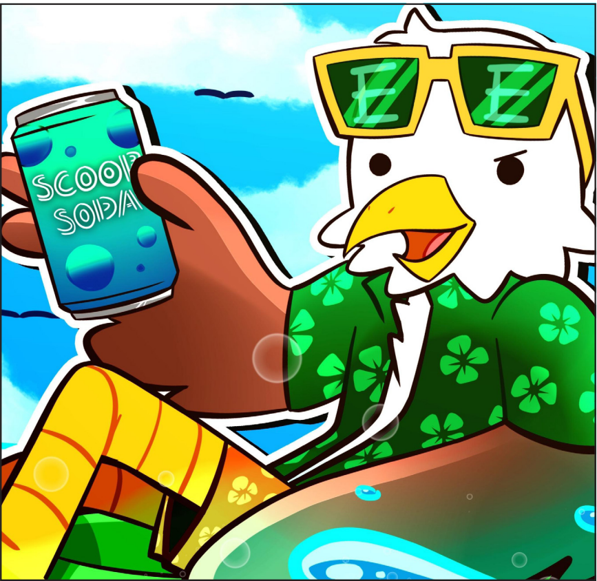
The Eastern Echo's mascot Scoop is happy to be enjoying the summer!