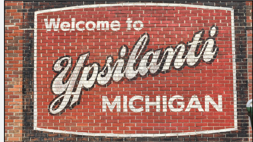
An Ypsilanti mural promotes the town on the side of Sweetwaters Coffee & Tea.