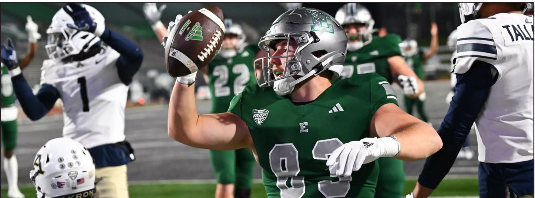
Eastern Michigan's tight end celebrates a touchdown against Akron during a thrilling matchup in 2023.

One of those major changes in the offseason was the groundbreaking announcement that NFL superstar Maxx Crosby had been named the assistant general manager of Eastern Michigan’s football team—the first active professional football player to join a college team’s administrative staff. Crosby’s landmark hire marks the pinnacle of the numerous ways that the Las Vegas Raider has given back to his alma mater. Between donating $1 million to the program in 2024 and seeing the playing surface at Rynearson Stadium renamed to “Crosby Field,” establishing the