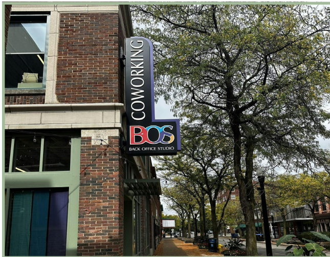
The Back Office Studio is a coworking space in Ypsilanti home to many companies.