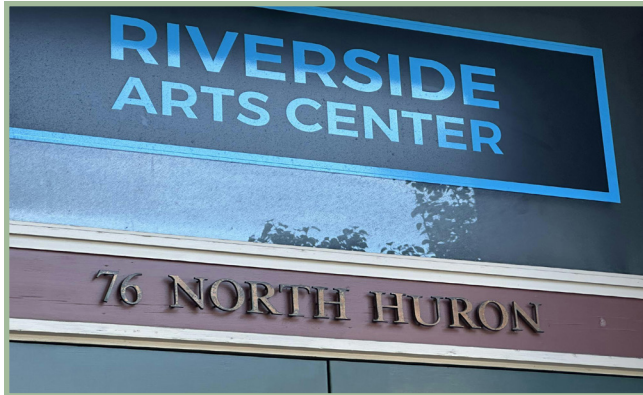
Riverside Arts Center is in downtown Ypsilanti.

Dec. 5-Jan. 9 Opening Reception Friday, Dec. 5 Riverside Arts Center North Gallery