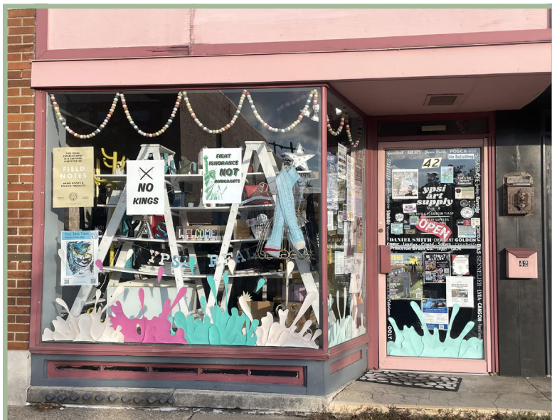
Ypsi Art Supply is located at 42 North Huron in Ypsilanti, MI.

Learn more about Foldenauer’s Ypsi Art Supply on the storefront’s Instagram, @YpsiArtSupply.