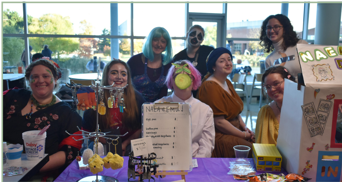
EMU NAEA hosts a table inside the Student Center selling handmade trinkets and providing free candy and face paints during Pumpkins on the Patio on Tuesday, Oct. 28.