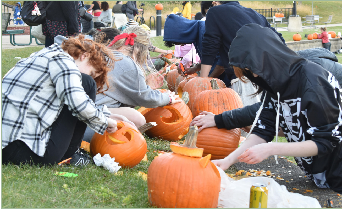
Students carve pumpkins outside of the Student Center on Tuesday, Oct. 28, 2025 during Pumpkins on the Patio.