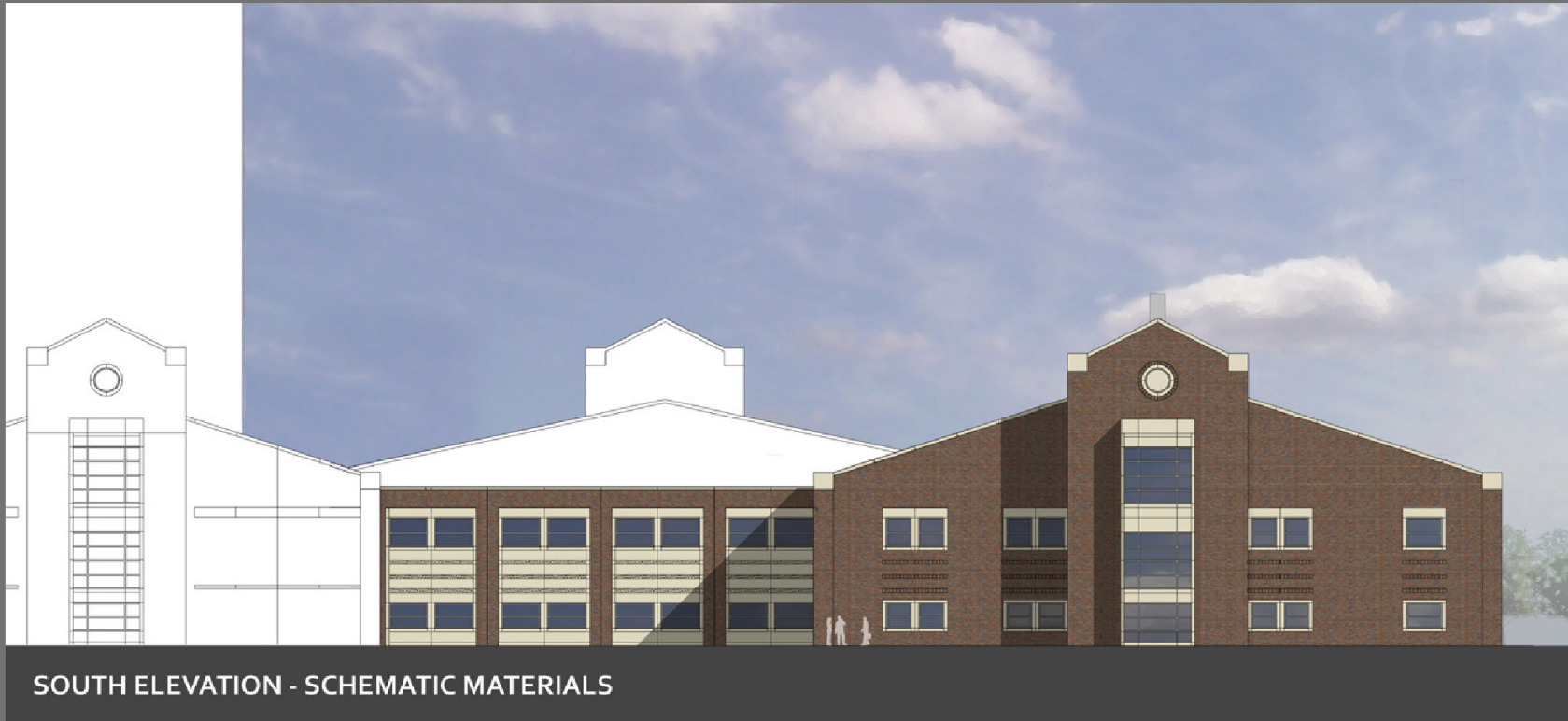
SOUTH ELEVATION - SCHEMATIC MATERIALS