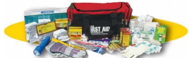
Kit will be similar to this