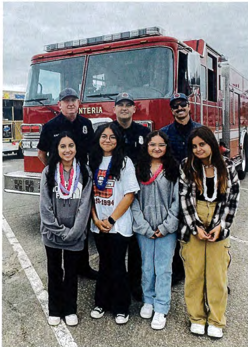
*Eighth Grade Graduation – Carpinteria Middle School