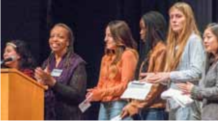
Essay & Poetry Winners