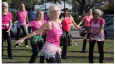
World Dance for Humanity