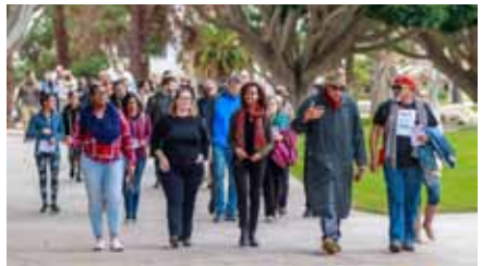
"Walk with Us" UCSB