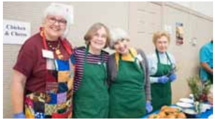
The many Volunteers