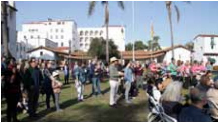
Gathering at De La Guerra Plaza