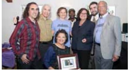
Dr. Martin Luther King, Jr. 50th Anniversary