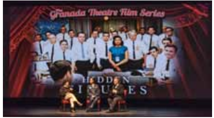
Movies that Matter - Hidden Figures