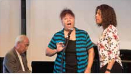
Songs in Praise