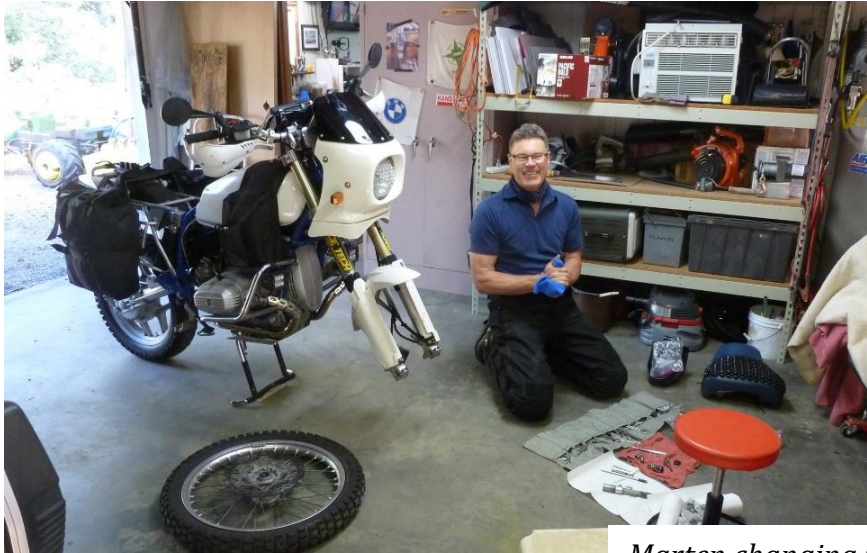
Marten changing tires.