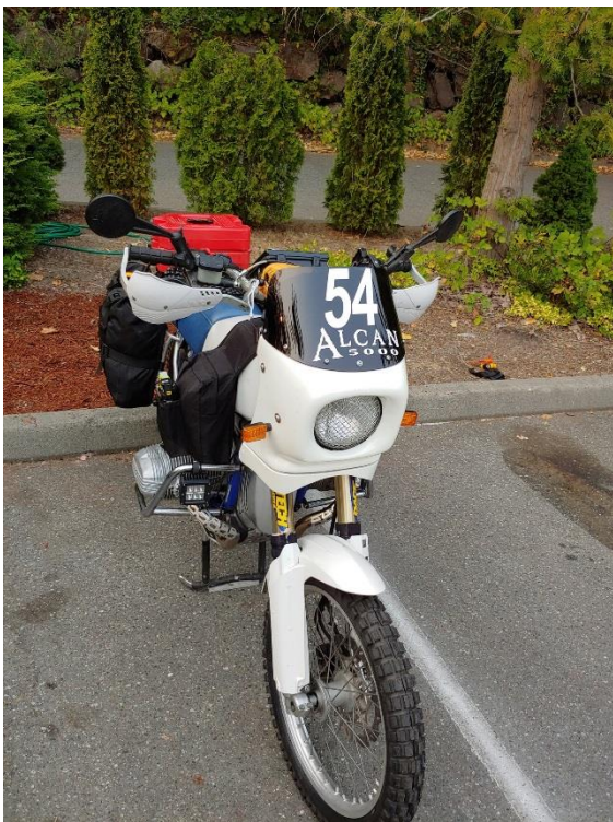
Ready to go at the start of the ride.