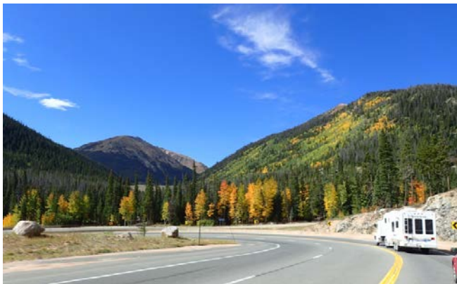
Fall colors on Berthoud Pass, CO. east of Denver.