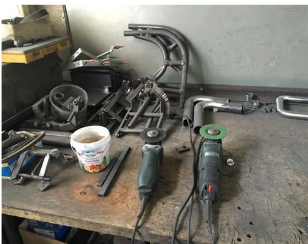
Curved frames make up the suspension.