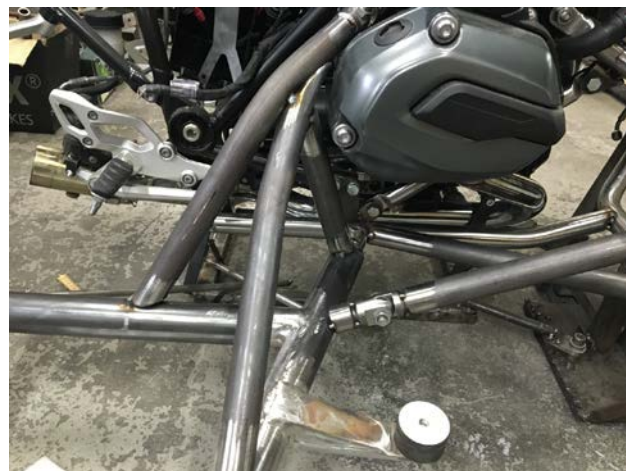
Detail of individual tubes being fitted