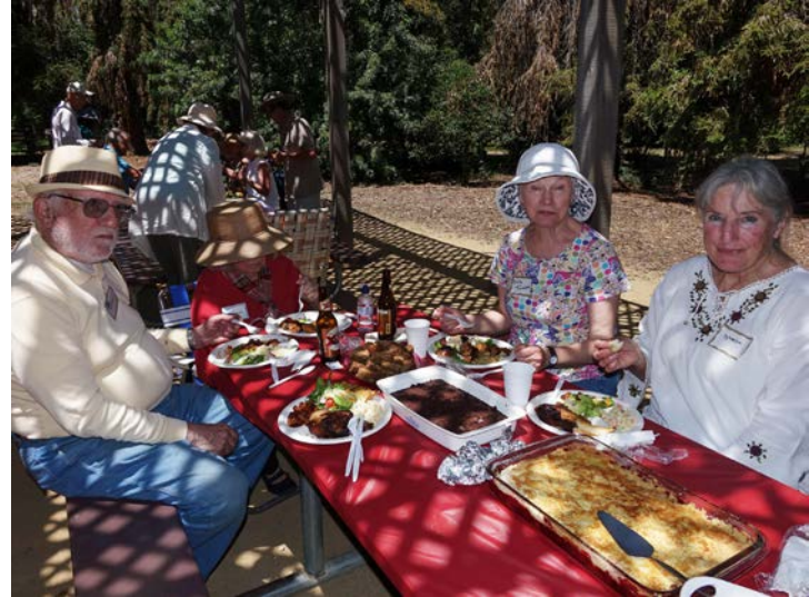
Our Summer Solstice picnic was held at Stow Grove Park. A lovely summer day, with good food provided by Woody's BBQ. Great conversation, games, and fun.