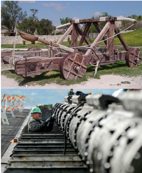
From medieval times to the present day, engineers have designed catapults to launch into the air projectiles as varied as stones and airplanes.

Grade Level: 5 (5-6) Time Required: 75 minutes Lesson Dependency: None Subject Areas: Physical Science Science and Technology