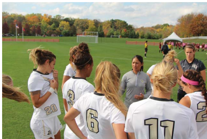
Head Coach Tiffany Roberts Sahaydak