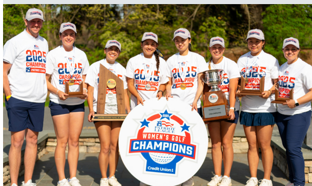
Navy claimed its third Patriot League Women's Golf title during the 2025 championship at the Saucon Valley Country Club in Bethlehem, Pa. The Mids placed five student-athletes in the top-12.

The Club has also been home to the Patriot League Men's Golf Championships seven times, including 1993, 1995, 2001, 2006, 2011, 2016 and 2021.