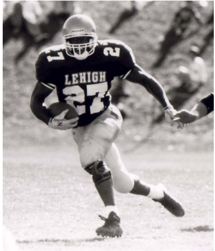
Lehigh RB Rabih Abdullah was a three-time All-Patriot League selection who went on to play seven seasons in the NFL with the Tampa Bay Buccaneers (1998-01), Chicago Bears (2002-03) and New England Patriots (2004).