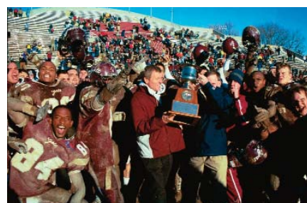
Lehigh (top) and Colgate (bottom) are the two winningest programs in Patriot League history.