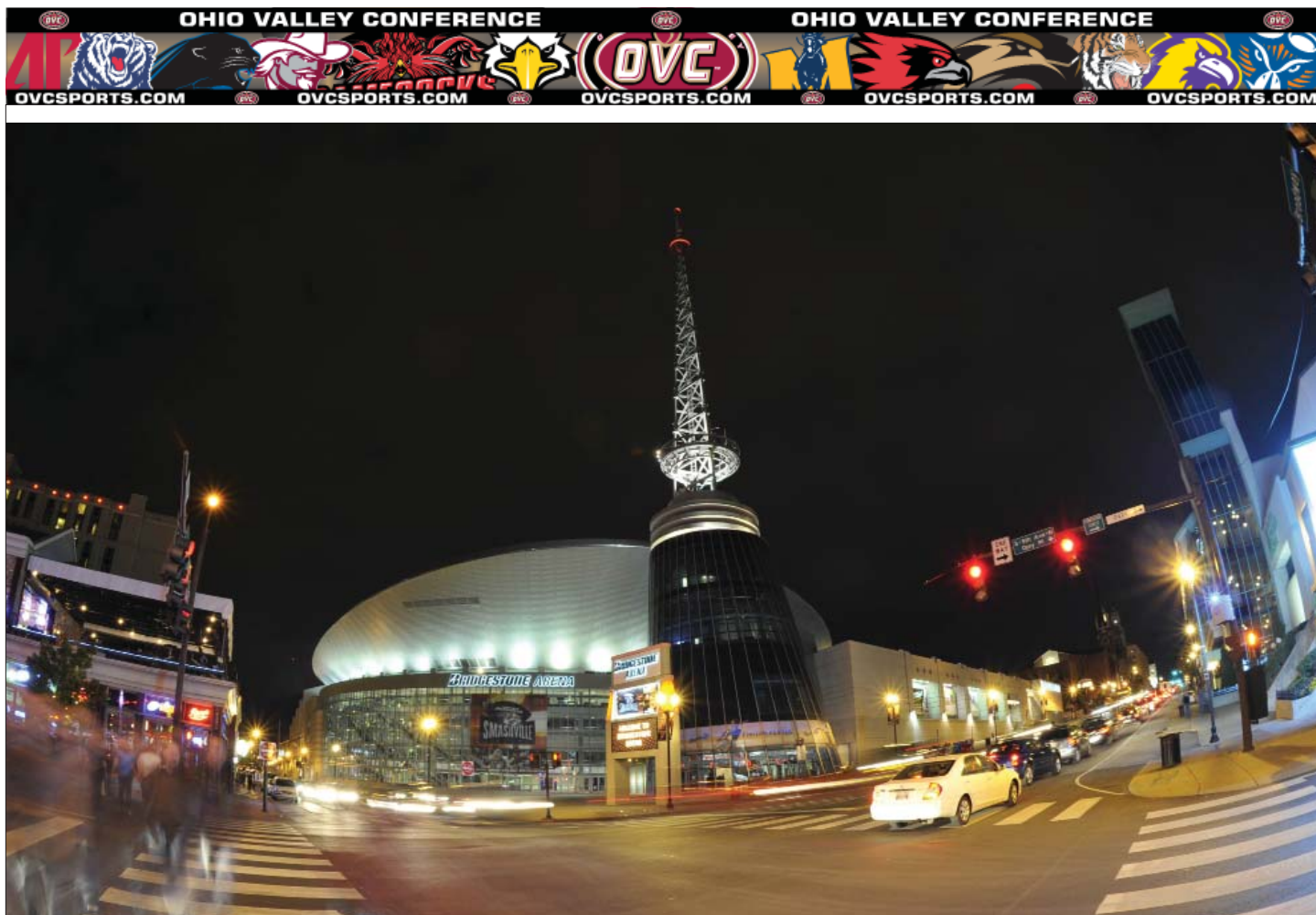
Bridgestone Arena, the home of the NHL's Nashville Predators, has hosted numerous basketball tournaments, including the 2012 NCAA Division I Men's Basketball 2nd/3rd Rounds, an event in which the Ohio Valley Conference served as the host.