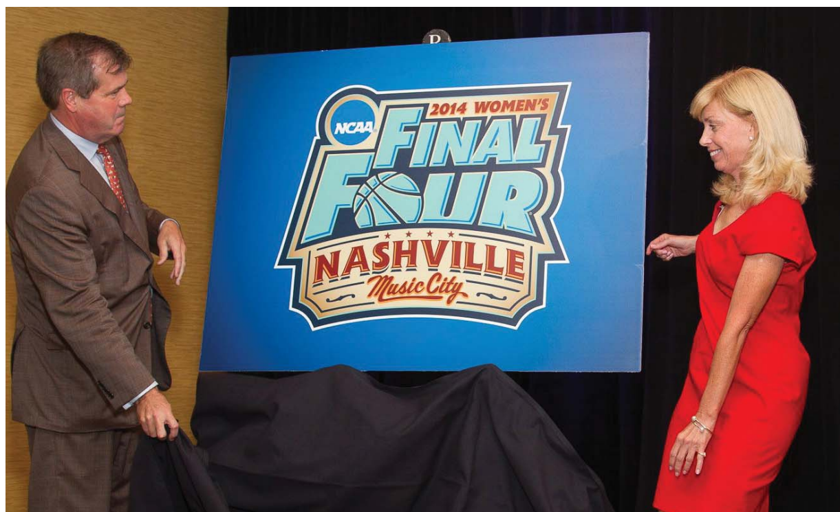
OVC Commissioner Beth DeBauche helps Nashville Mayor Karl Dean unveil the official 2014 NCAA Division I Women's Final Four logo.