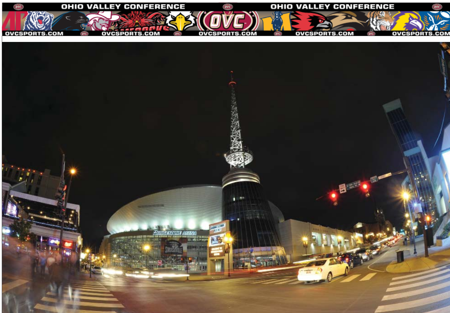
Bridgestone Arena, the home of the NHL's Nashville Predators, has hosted numerous basketball tournaments, including the 2012 NCAA Division I Men's Basketball 2nd/3rd Rounds, an event which the Ohio Valley Conference served as hosts.

the committee's charge to determine which of the cities would best serve as future host sites for the pinnacle of women's basketball – the Women's Final Four. The committee appreciated the work and effort of each of the cities that participated in this bid selection process. Committee members evaluated each prospective host city based on many criteria, weighing each element's importance and what is critical to successfully host a Women's Final Four."