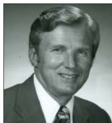
Paul Dietzel (1975-76)