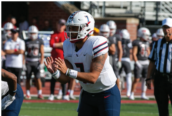
Duquesne shut out an NEC opponent for the fourth straight season as the Dukes rolled past Sacred Heart, 27-0, to remain on top of the league standings with a perfect 4-0 record.