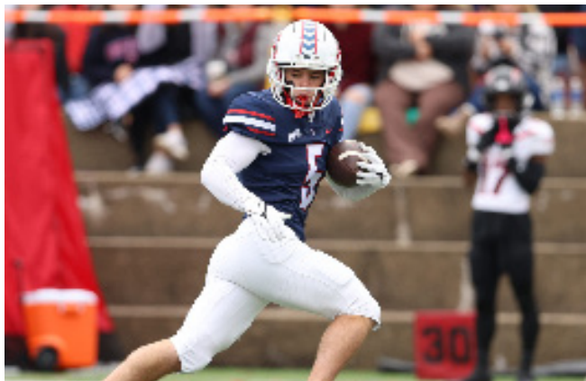
Duquesne held off a Saint Francis U comeback to hold on to first place in the NEC standings and remain unbeaten in NEC play in front of a standing-room only Homecoming & Family Weekend crowd of 3,052 at Rooney Field.