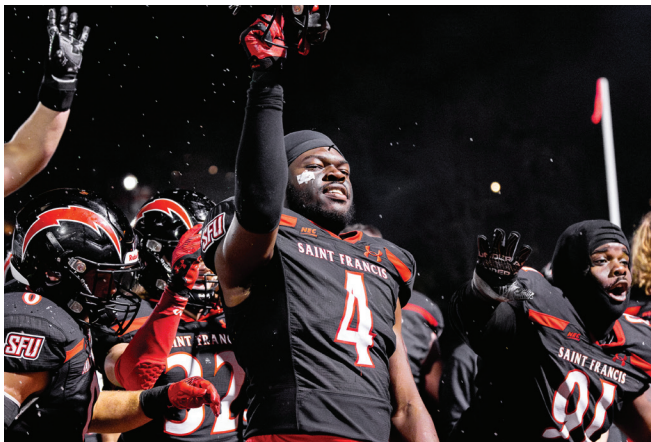
Playing in front of record-breaking crowd of 2,878 fans, Saint Francis U handed Wagner its first loss of NEC play on Thursday in the first-ever conference game to air on national TV (CBS Sports Network).

Yale used a strong defensive effort to score a 31-3 win over Sacred Heart in non-conference action on Saturday in the first-ever meeting between the two Nutmeg State teams. Entering the game ranked first in the FCS in passing yards allowed per game, the Pios defense limited the Bulldogs to 123 yards in the air, a mark that is nearly 100 yards below their season average of 219.5 yards per game.